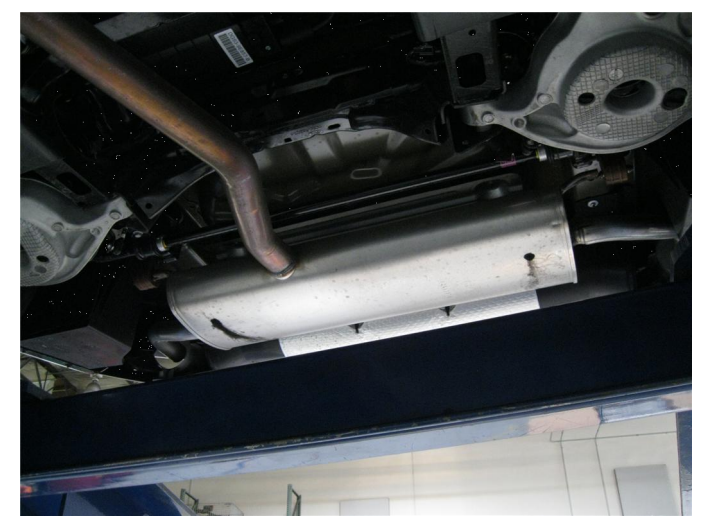
Step 2. Disengage the welded hangers from the rubber insulators on the muffler assembly. Again, retain all mounting hardware as it will be needed to mount your new system. The OEM exhaust may now be removed in one piece.