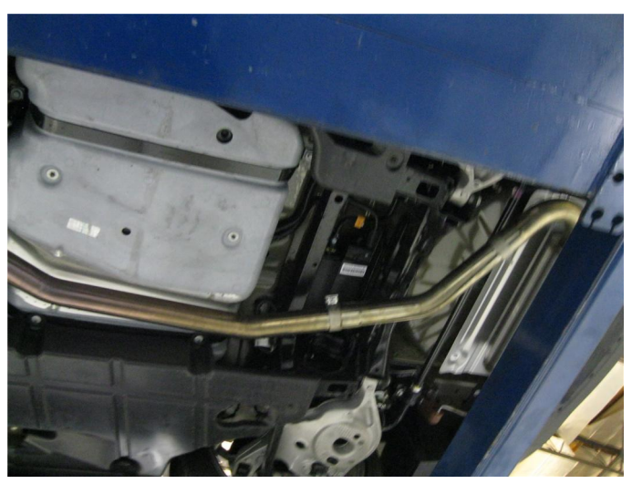
Step 4. Loosely install the Mid Pipe to the Resonater Assembly and Connecting Pipe using the supplied 2.50" clamps.