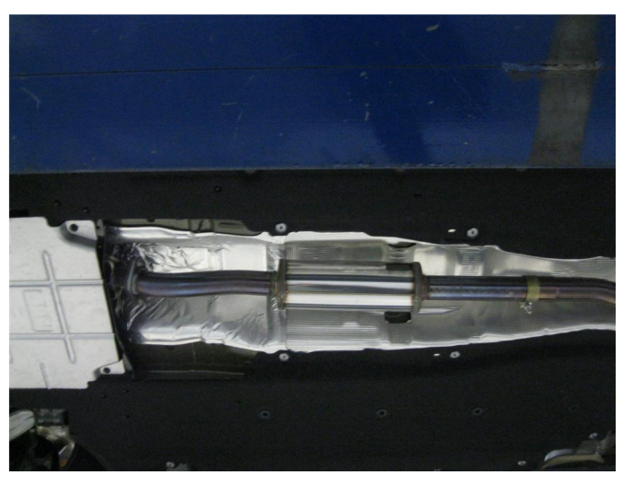
Step 3. Begin installing your new system by loosely attaching the inlet flange of the Resonator Assembly to the catalytic converter outlet using the OEM fasteners.