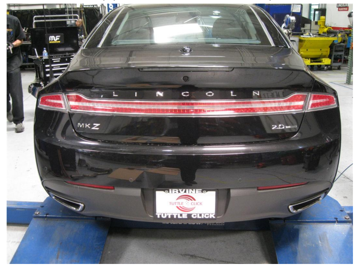
Step 6. Once a final position has been chosen for the new exhaust system, evenly tighten all clamps from front to rear using the torque specifications on page one of the instructions. Inspect all fasteners after 25-50 miles of operation and re-tighten if necessary.