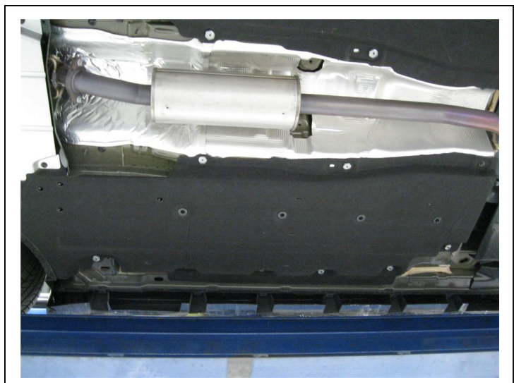
Step 1. Begin removing the OEM exhaust system by unbolting the flange at the catalytic converter outlet. Retain the mounting hardware as it will be needed to install your new system.