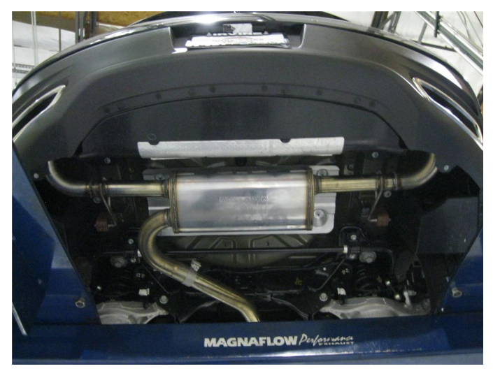
Step 5. Next install the Muffler Tail Pipe Assembly by attaching it to the Connecting Pipe with the supplied clamp and engaging all welded hangers to the rubber insulators. Locate both tail pipes to the OEM exhaust tip shrouds.