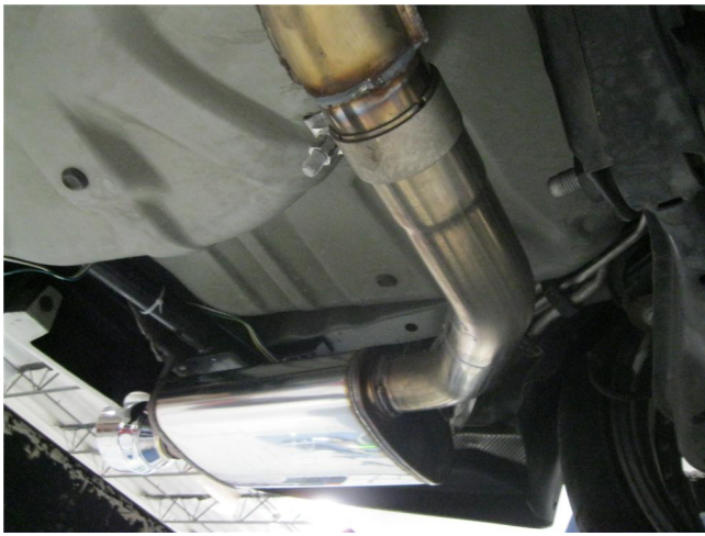
Step 4. Finish by installing both Muffler Assemblies using the supplied 2.50" clamps, fitting the hangers into the rubber insulators.