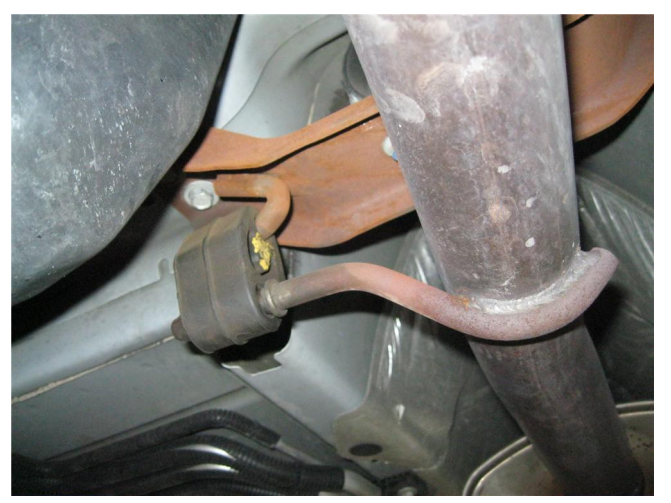
Step 1. begin removal of the OEM system by loosening the clamp at the outlet the flex pipe. Working front to rear detach all hangers from rubber insulators and remove the system. Retain rubber insulators as they will be re-used the mount the new system.