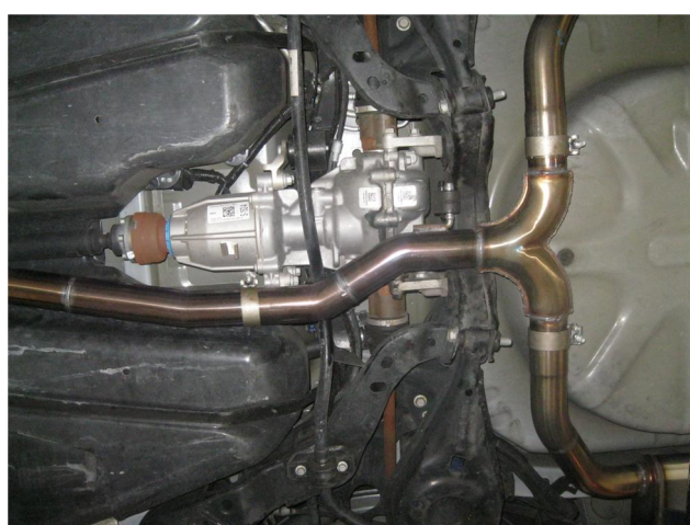
Step 3. Next attach the Mid-Pipe Assembly to the Resonator, followed by the Y-Pipe Assembly. Use supplied 2.50" clamps and fit hangers into rubber insulators.