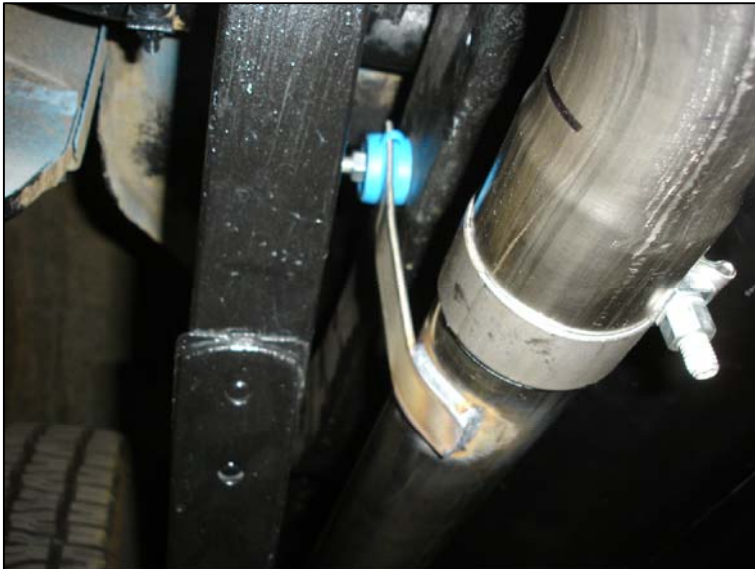
Fig # 2

Step 5: Slip the outlet pipe assemblies to the over axle pipe assemblies. Secure with the supplied clamps. Locate the correct hanger placement on the frame rail adjacent to the leaf springs. Drill 3/8" clearance hole and mount hanger to the frame using the supplied rubber grommet and hardware. (See Fig # 2).