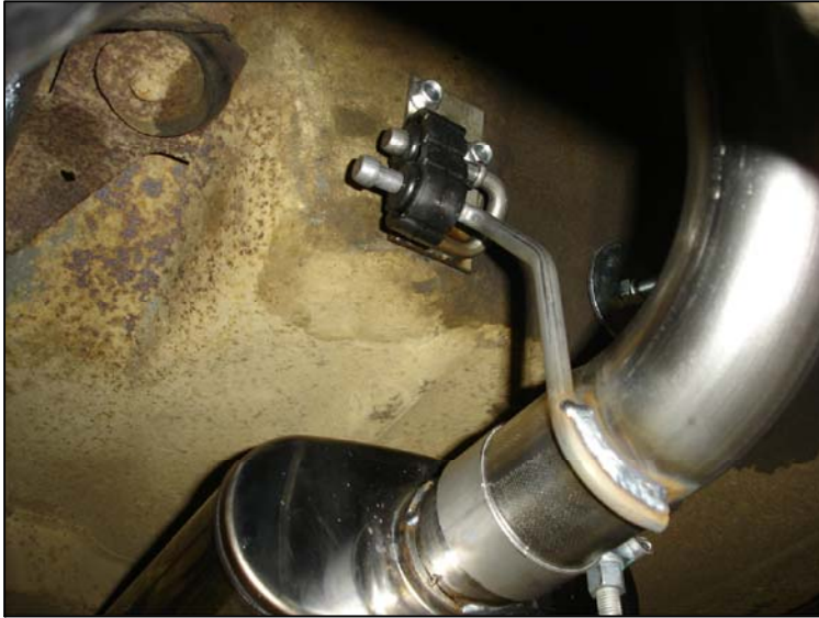
Fig # 1