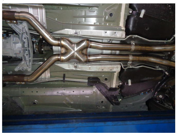
Step 2. Begin installing the new system by loosely attaching both inlet pipes of the X-Pipe Assembly to the catalytic converter outlets using the OEM clamps.