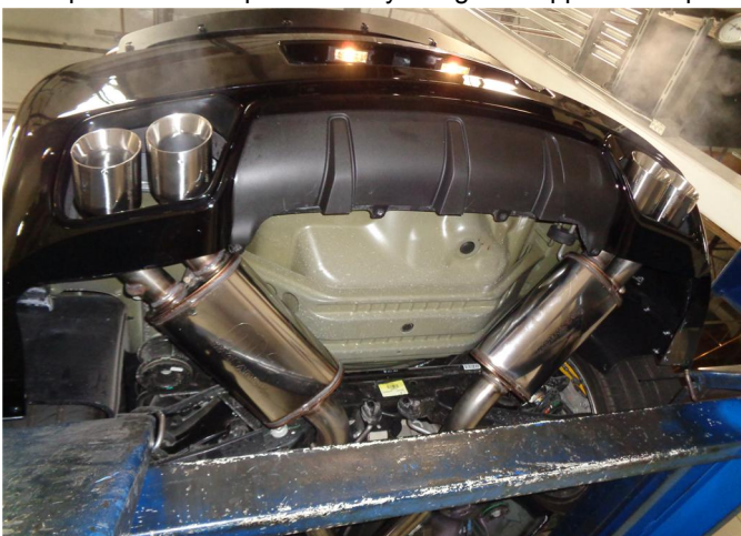
Step 4. Loosely install both muffler assemblies using the supplied clamps. Locate all welded hangers to the OEM rubber insulators.