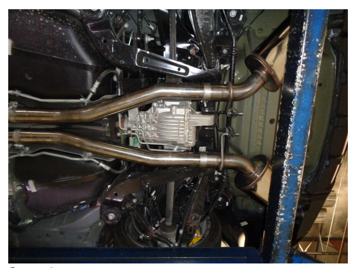
Step 3. Next, loosely install both driver and passengers side Mid Pipes to the X-Pipe Assembly using the supplied clamps.