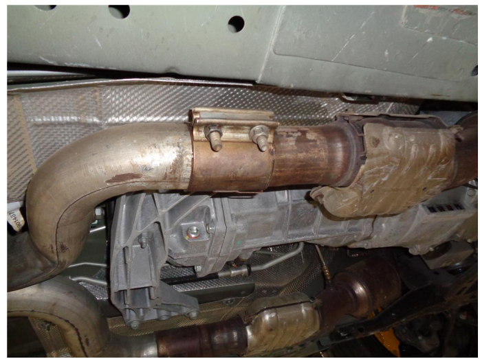
Step 1. To remove the OEM exhaust system you will first need to loosen the clamps attaching the exhaust system to the catalytic converter outlet pipes. Working front to rear disengage all welded hangers from the rubber insulators. The OEM exhaust system can now be removed. Retain all mounting hardware as it will be needed to install your new MAGNAFLOW system.