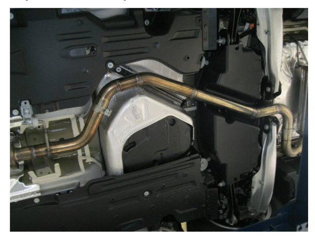
Step 3. Next attach the Mid-Pipe to the Resonator Assembly using a 2.50" clamp.

Step 2. To install the new Magnaflow exhaust system begin by attaching the Resonator Assembly to the outlet of the OEM system using a supplied 2.50" clamp and fitting the hanger into the rubber insulator. Leave all clamps loose until final adjustment of the system.