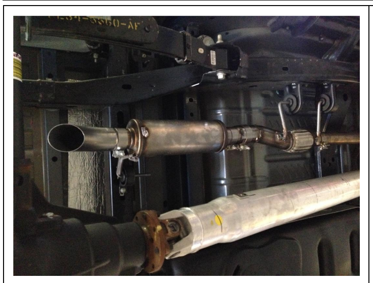
Step 5. Once a final position has been chosen for the new exhaust system, evenly tighten all clamps from front to rear using the torque specifications on page one of the instructions. Inspect all fasteners after 25-50 miles of operation and re-tighten if necessary.