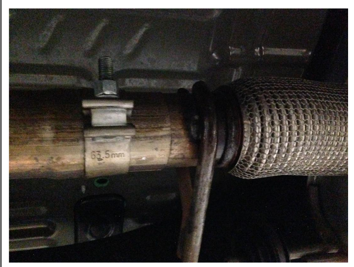
Step 1. To remove the OEM exhaust system, loosen the clamp attaching the systems inlet pipes to the catalytic converter outlet pipes. Disengage all welded hangers from the OEM rubber insulators. Do not discard the OEM fasteners or damage the rubber insulators as they will be needed to mount your new MAGNAFLOW system.