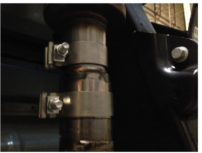
Step 3. Install the Extension Pipe between the Inlet Pipe Assembly and the Muffler Assembly using the supplied 3.00" and 2.50" clamps. Engage the welded hanger to the rubber insulator.