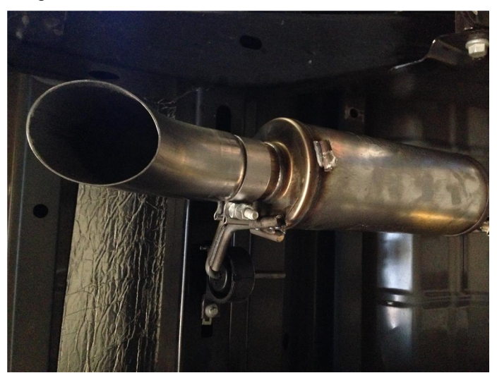
Step 4. Install both the Turn Down Tip with the supplied 2.50" clamp.