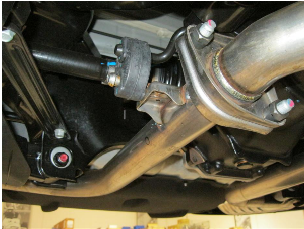
Step 1. To extract the OEM exhaust system you will first need to remove the brace located in front of the factory resonator. Next un-fasten the flanges located behind the catalytic converters and resonator and disengage all welded hangers from the rubber insulators. Do not damage or discard the rubber insulators or fasteners as they will be re-used to mount the new system. You can now remove the exhaust from the vehicle.