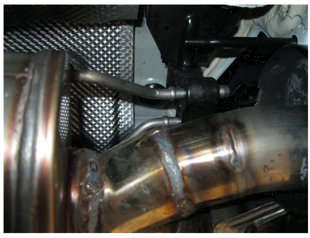
Step 3. Next Install the Mid-Pipe Assemblies to the outlets of the Resonator Assembly and then the Muffler Assemblies to the Mid-Pipes using the supplied 2.50" clamps. Insert hangers into rubber insulators. Re-attach brace.