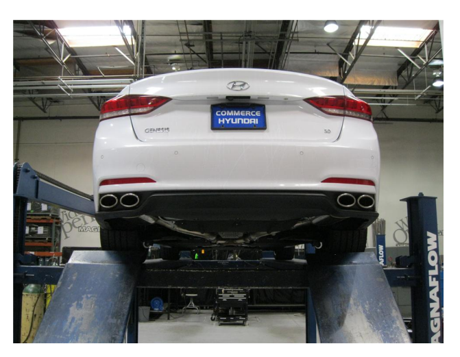
Step 4. Once a final position has been chosen for the new exhaust system, evenly tighten all clamps from front to rear using the torque specifications on page one of the instructions. Inspect all fasteners after 25-50 miles of operation and re-tighten if necessary.