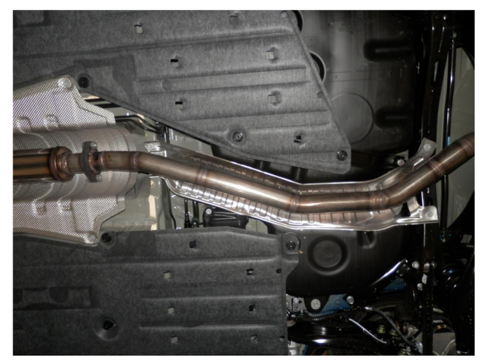
Step 4. Next attach the Y-Pipe Assembly to the Inlet Resonator Assembly by coupling the flanges using the supplied gasket and hardware.

MAGNAFLOW: 22961 Arroyo Vista - Rancho Santa Margarita, CA 92688 | 1(800) 990-0905 Technical Support: 1(800) 959-9226 | Email: moreinfo@magnaflow.com