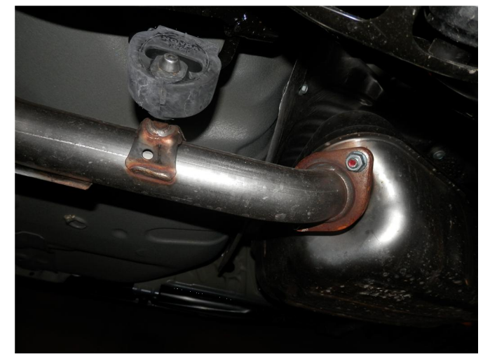
Step 2. Unbolt the drivers side OEM muffler assembly at the flange junction. Disengage all welded hangers from the rubber isolators. The OEM exhaust system may now be removed.

Step 1. Begin removal of the OEM exhaust system by unbolting the inlet flange attaching the exhaust to the catalytic converter. Do not discard or damage the OEM fasteners or rubber insulators as they will be used to install the new system.