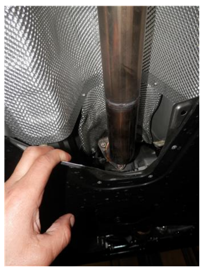
Step 3. Begin installation of your new MAGNAFLOW system by attaching the Inlet flange of the Inlet Resonator Assembly to the catalytic converter outlet using the OEM fasteners. Engage the welded hanger to the rubber isolator. Keep all fasteners and clamps loose until final adjustment.