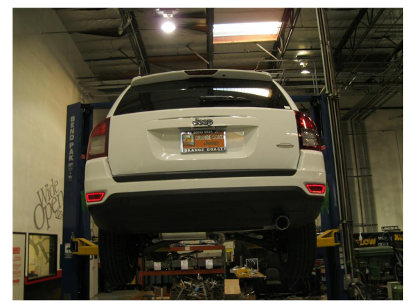
Step 6. Once a final position has been chosen for the new exhaust system, evenly tighten all clamps from front to rear using the torque specifications on page one of the instructions. Inspect all fasteners after 25-50 miles of operation and re-tighten if necessary.

MAGNAFLOW: 22961 Arroyo Vista - Rancho Santa Margarita, CA 92688 | 1(800) 990-0905 Technical Support: 1(800) 959-9226 | Email: moreinfo@magnaflow.com