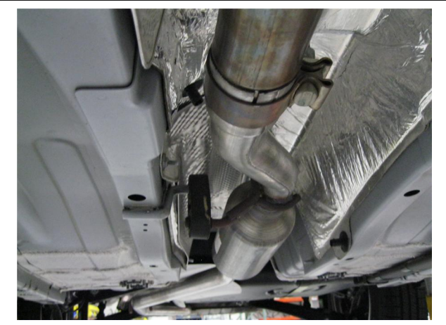
Step 1. Begin removal of the OEM exhaust system by loosening the clamp behind the catalytic converter