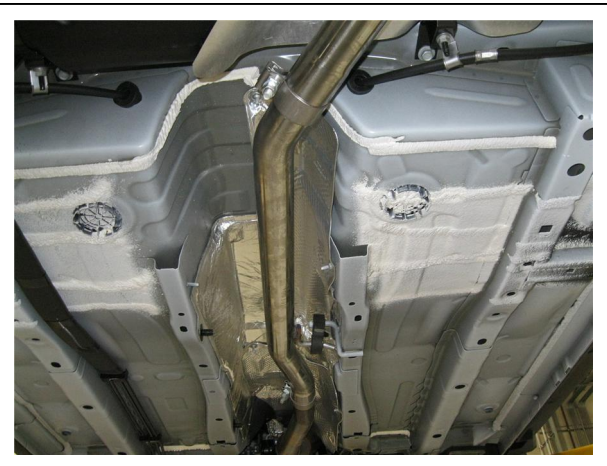
Step 4. Next use the supplied 2.25" clamp to attach the Mid-Pipe to the Inlet Pipe.