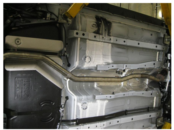
Step 3. Begin installation of your new MAGNAFLOW system by attaching the Inlet Pipe Assembly to the catalytic converter outlet using the 2.25" supplied Clamp and OEM insulator. Keep all fasteners and clamps loose until final adjustment.

Step 2. Disengage hangers from rubber insulators and remove the OEM exhaust.