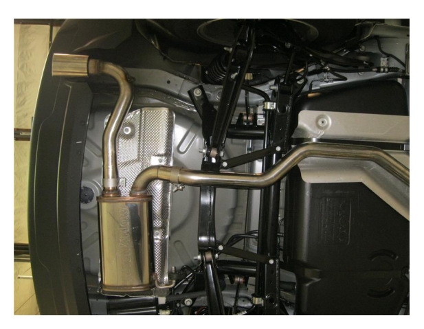
Step 5. Next use the supplied 2.25" clamps to attach the Muffler Assembly to the Mid Pipe and the Tail Pipe Assembly to the Muffler. Fit hangers into rubber insulators.