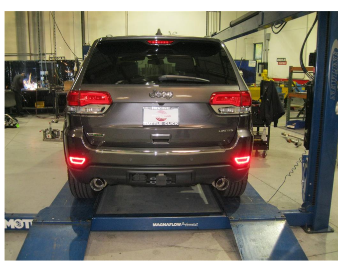
Step 5. Once a final position has been chosen for the new exhaust system, evenly tighten all clamps from front to rear using the torque specifications on page one of the instructions. Inspect all fasteners after 25-50 miles of operation and re-tighten if necessary.