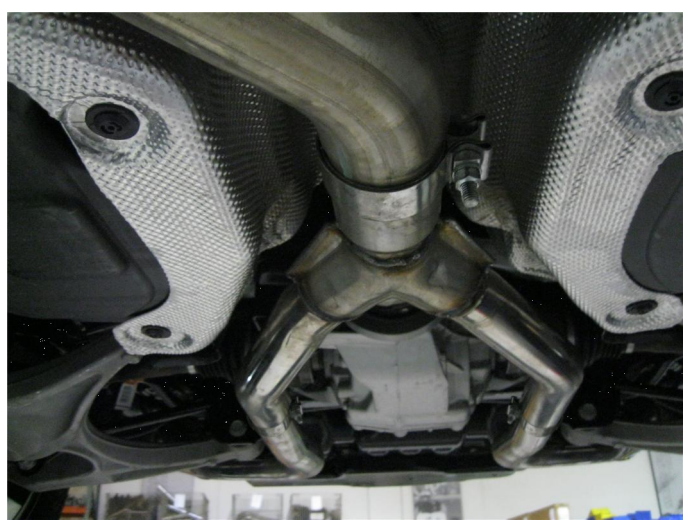
Step 2. Begin installation of the new system by fastening the inlet Y-Pipe Assembly to the outlet of the catalytic converter using the supplied 2.75" band clamp. Leave all clamps loose for the final adjustment of the complete system.