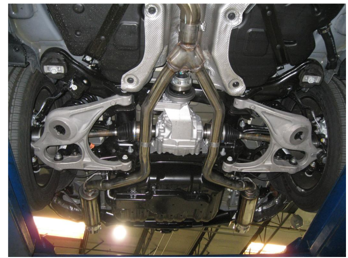
Step 3. Next attach the driver and passenger side Extension Pipes using the supplied 2.25" clamps.