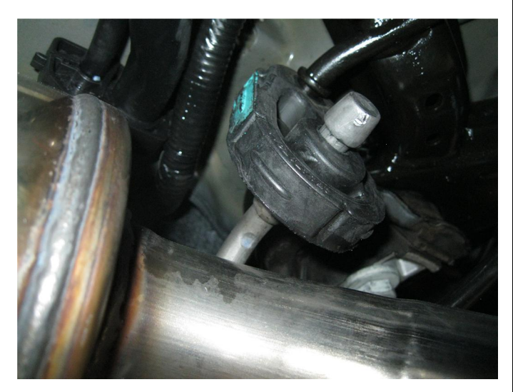
Step 4. Finish by installing both Muffler Assemblies using the supplied 2.25" clamps, fitting the hangers into the rubber insulators and re-attaching ground strap..