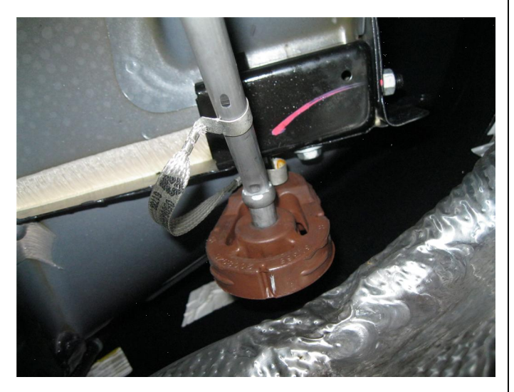
Step 1. To remove the OEM exhaust system loosen the clamp fastening the Y-Pipe/Muffler Assembly to the Catalytic Converter outlet, un-clip the ground strap from the rear hanger. Disengage the hangers from the rubber insulators and remove the system. Do not discard the or damage the rubber insulators as they will be used to mount the new system.