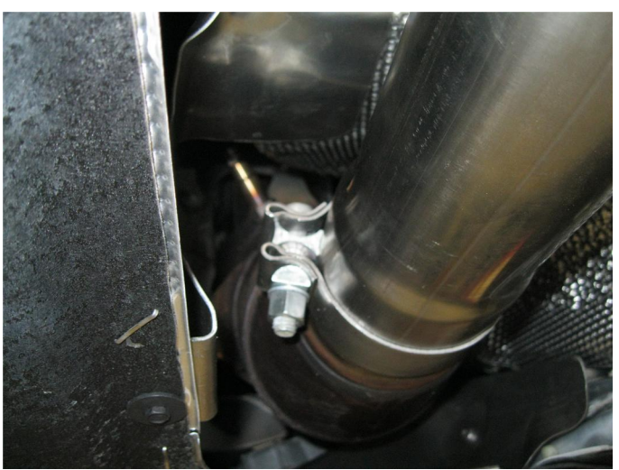
Step 2. Begin installation of the new system by fastening the Inlet Pipe to the outlet of the catalytic converter using the supplied 3.00" clamp.