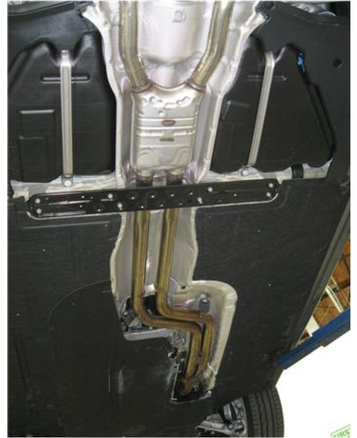
Step 1. To allow for extraction of the OEM system you must first remove the underside cross brace. Next loosen the clamp at the outlet of the catalytic converter. Working front to rear detach all hangers from rubber insulators and remove the system. Retain rubber insulators and clamp as they will be re-used the mount the new system.