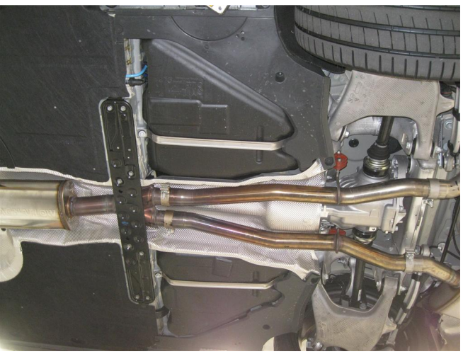
Step 3. Next attach the Resonator Assembly to the Y-Pipe Assembly followed by the two Mid-Pipe assemblies, use supplied clamps and fit hangers into rubber insulators.