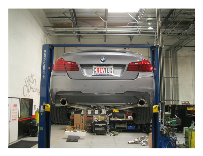
Step 5. Once a final position has been chosen for the new exhaust system, evenly tighten all clamps from front to rear using the torque specifications on page one of the instructions. Inspect all fasteners after 25-50 miles of operation and re-tighten if necessary.