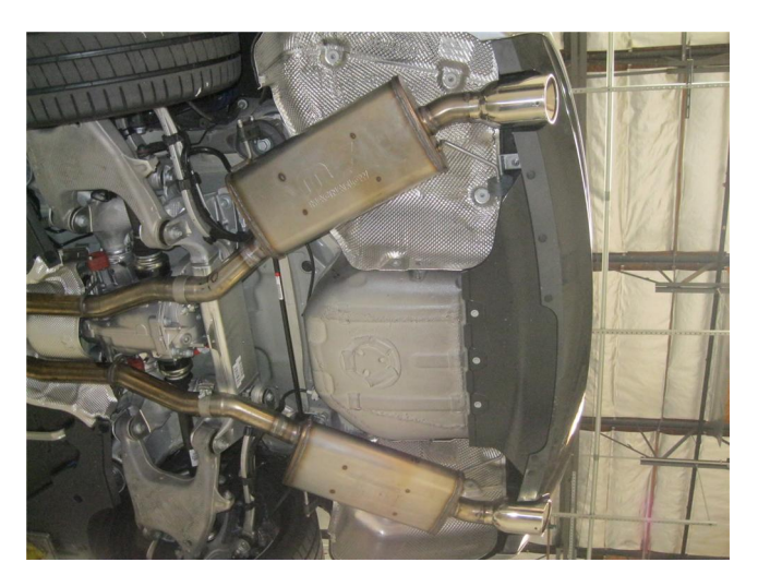
Step 4. Finish by installing both Muffler Assemblies using the supplied clamps, fitting the hangers into the rubber insulators and re-attaching the cross brace.