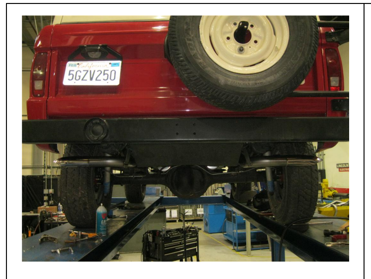
Step 5. Once a final position has been chosen for the new exhaust system, evenly tighten all clamps from front to rear using the torque specifications on page one of the instructions. Inspect all fasteners after 25-50 miles of operation and re-tighten if necessary.