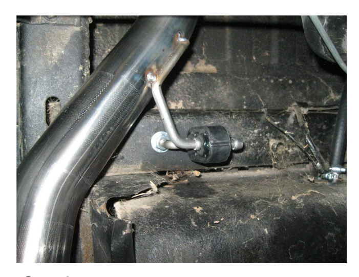
Step 3. Before installing the Tail Pipe Assemblies you will need to install the supplied threaded hangers into holes in the frame rails behind the rear differential using two supplied nuts and washers to adjust height and lock into place.