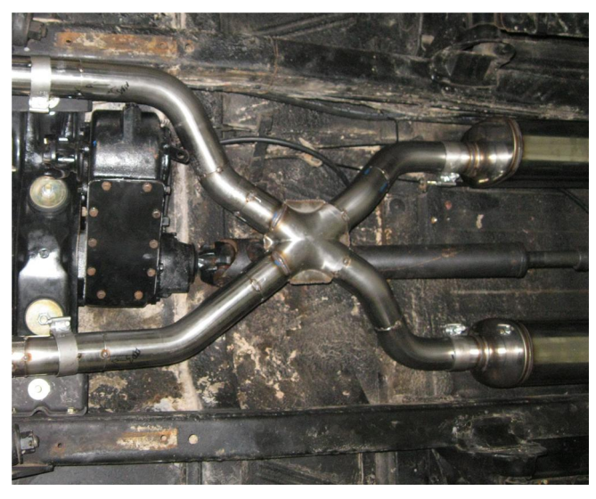
Step 1. After removal of the OEM system you can begin installation of the Magnaflow system. Start by attaching the X-Pipe Assembly to the factory outlets using the supplied 2.50" clamps. Leave all clamps and fasteners loose until final adjustment.