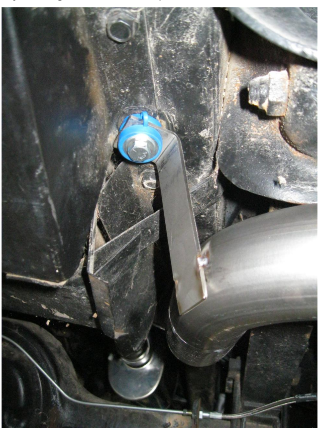
Step 4. Install Tailpipe Assemblies using supplied 2.50" clamps. Fit hangers onto installed hangers using the supplied black rubber insulators. Fit hanger brackets to existing threaded holes in the frame rails using the supplied blue grommets and fasteners.