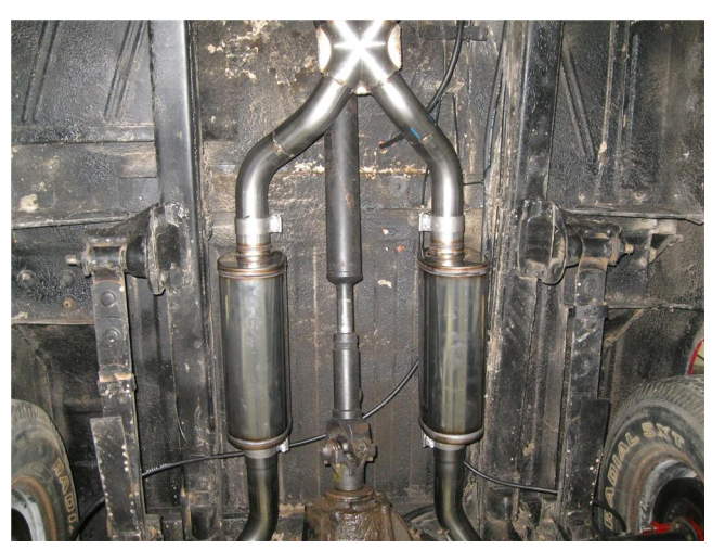
Step 2. Next install the mufflers as shown (be aware of orientation) using the supplied 2.50" clamps.