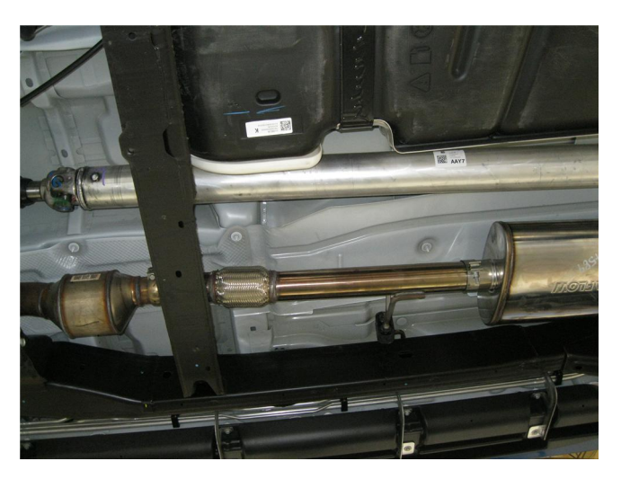
Step 2. Begin installation of the new system by attaching Inlet Pipe Assembly at the ball flare using the OEM clamp and fitting the hanger into the rubber insulator. Next attach the muffler to the inlet pipe using a supplied 3.00" clamp. Leave all clamps loose for final adjustment of the complete system.