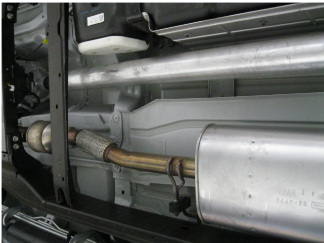
Step 1. To remove the OEM exhaust system, you will first need to cut the pipe behind the muffler before it goes over the axle. You can then disengage the welded hangers from the rubber insulators and remove the tailpipe. Unfasten the muffler inlet from the catalytic converter at the clamp junction. Do not damage or discard the OEM fasteners or rubber insulators, as they will be reused to mount the new system. Disengage the muffler hangers and remove it from the vehicle.