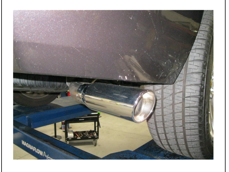
Step 4. Once a final position has been chosen for the new exhaust system, evenly tighten all clamps from front to rear using the torque specifications on page one of the instructions. Inspect all fasteners after 25-50 miles of operation and re-tighten if necessary.