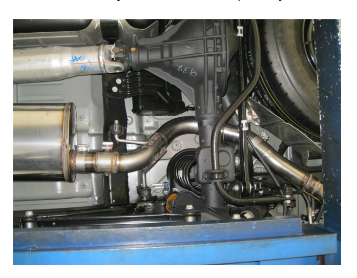
Step 3. Complete the initial installation by attaching the Extension Pipe Assembly (containing the exhaust valve) to the Muffler and the Resonator/Tailpipe Assembly the Extension Pipe using the suplied 3.00" clamps.