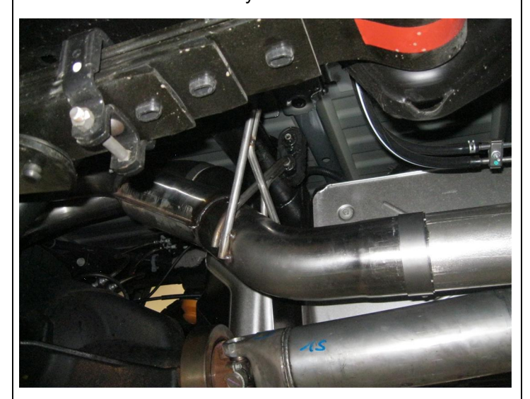
Step 2. Begin installation of the Magnaflow system by first clamping the Y-Pipe Assembly inlet to the newly cut outlet of the DPF using the supplied 4.00" clamp. Then attached the two Extension Pipes to the Y-Pipe Assy using the suplied 3.50" clamps and fitting the hangers in the rubber insulators (leave all clamps loose for final adjustment of the complete system). If your vehicle has an O2 sensor re-install at this time. If not, install the provided sensor boss plug.