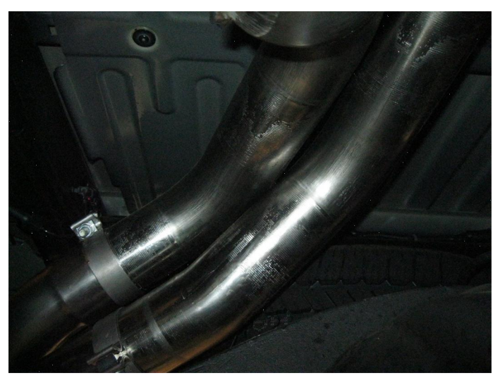
Step 3. Next Install the Tail Pipe Assembly to the Extension Pipes in a similar fashion using the supplied 3.50" clamps and by fitting the welded hangers into the rubber insulators.