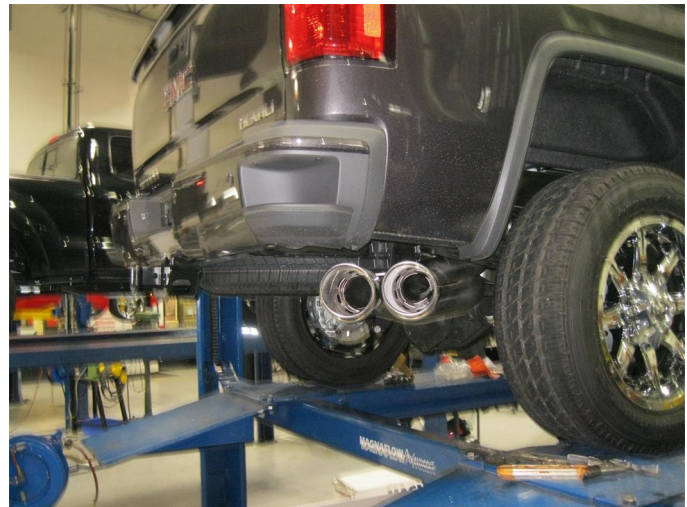
Step 4. Once a final position has been chosen for the new exhaust system, evenly tighten all clamps from front to rear using the torque specifications on page one of the instructions. Inspect all fasteners after 25-50 miles of operation and re-tighten if necessary.