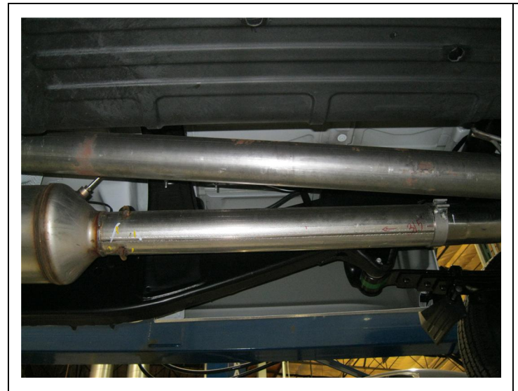
Step 1. To begin the removal of the OEM system check to see if it has an o2 sensor connected to the exhaust system, if so remove the sensor and hang it out of the way. Next, you will need to cut the exhaust pipe behind the DPF. If your vehicle has a Crew Cab/Standard Bed you will need to cut 31.50" rearward of the DPF. For Crew Cab/Short Bed cut at 18.25". For Extended Cab/Short Bed cut at 9.50" as shown in the diagram. You can then disengage the welded hangers from the rubber insulators, working rearward finish removing the system. Do not damage or discard the rubber insulators, as they will be reused to mount the new system.