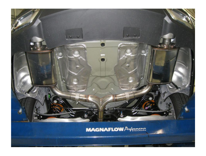
Step 4. Finish by installing the Muffler Assemblies to the Y-Pipe Assembly using the supplied 2.50" clamps, and fitting the welded hangers into the rubber insulators.