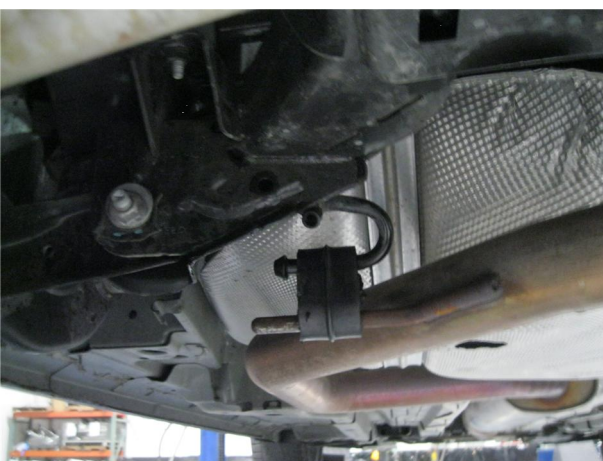
Step 1. To remove the OEM exhaust system, you will first need to unbolt the resonator from the catalytic converter and disengage all welded hangers from the rubber insulators. Do not damage or discard the rubber insulators, as they will be reused to mount the new system. You can now remove the exhaust from the vehicle.