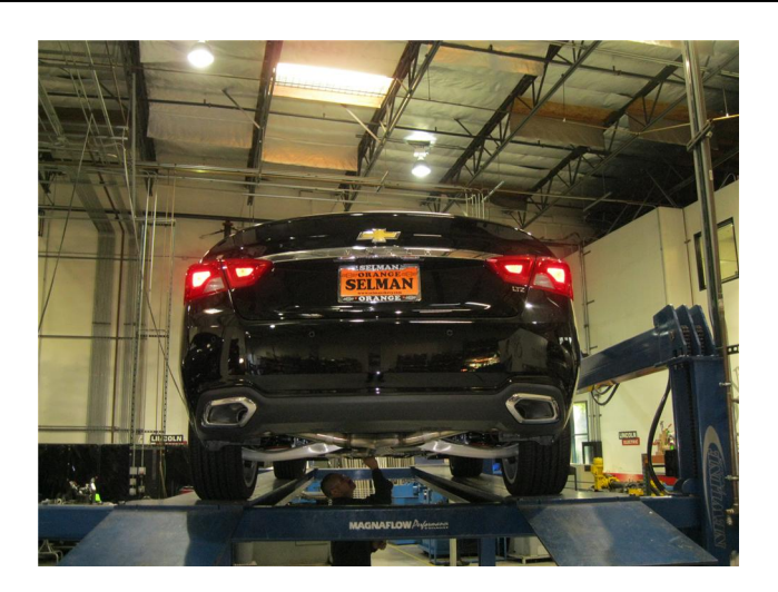
Step 5. Once a final position has been chosen for the new exhaust system, evenly tighten all clamps from front to rear using the torque specifications on page one of the instructions. Inspect all fasteners after 25-50 miles of operation and re-tighten if necessary.