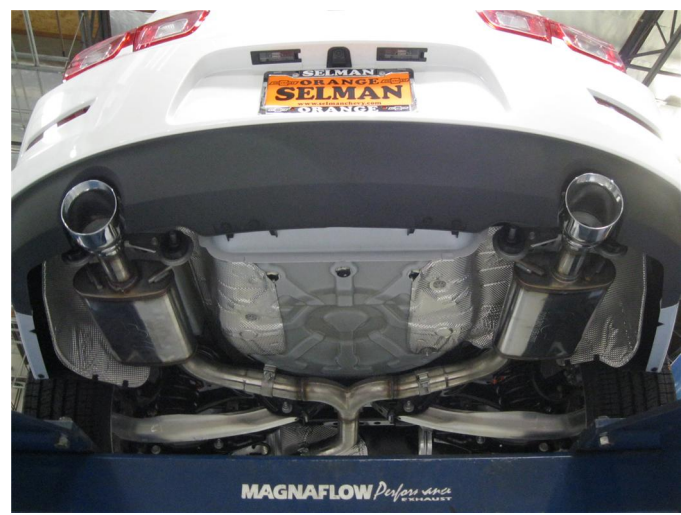
Step 4. Finish by installing the Muffler Assemblies to the Y-Pipe Assembly using the supplied 2.50" clamp, and fitting the welded hanger into rubber insulator.