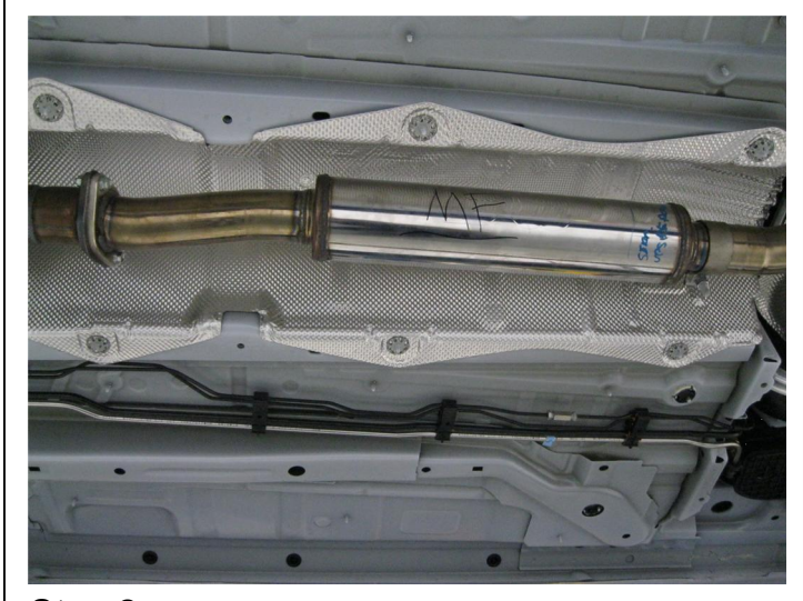
Step 2. To begin, fasten the Resonator assembly inlet to the catalytic converter using the provided fasteners and gasket (Leave all clamps and fasteners loose for final adjustment of the complete system.)