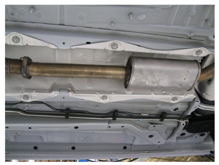
Step 1. To remove the OEM exhaust system, you will first need to unbolt the resonator from the catalytic converter and disengage all welded hangers from the rubber insulators. Do not damage or discard the rubber insulators, as they will be reused to mount the new system. You can now remove the OEM exhaust from the vehicle.