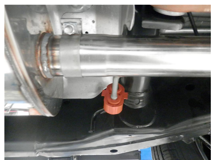
Step 5. Loosely attach the Over-Axle Pipe Assembly and the Tail Pipe Assembly using the supplied 3.00" clamps and engage the welded hangers to the OEM rubber insulators.