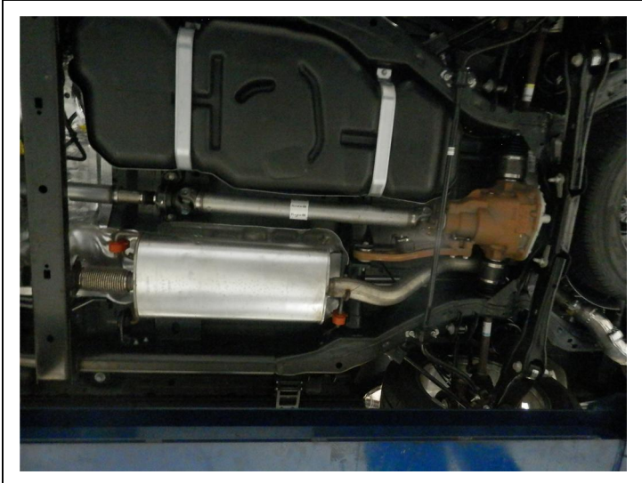
Step 1. To remove the OEM exhaust system you will first need to remove the rear sway bar.