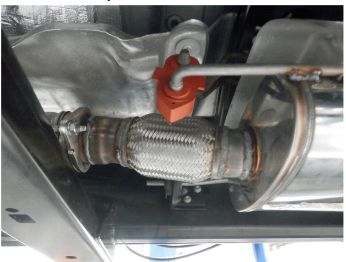
Step 4. Begin installing your new MAGNAFLOW system by loosely bolting the Muffler Assembly inlet flange to the OEM catalytic converter outlet using the supplied hardware.