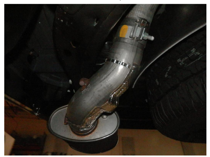
Step 2. Next, remove the tail pipe section by loosening the OEM clamp. Disengage the welded hanger from the rubber insulator and remove the tail pipe assembly. Do not discard the or damage the rubber insulators as they will be used to mount the new system.