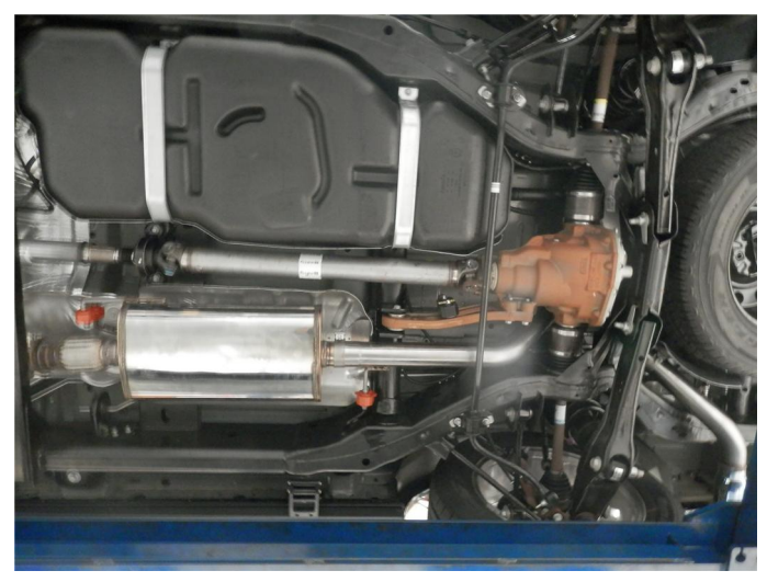
Step 6. Re install the Sway Bar.