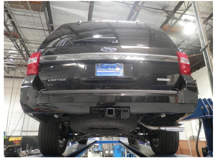
Step 7. Once a final position has been chosen for the new exhaust system, evenly tighten all clamps from front to rear using the torque specifications on page one of the instructions. Inspect all fasteners after 25-50 miles of operation and re-tighten if necessary.