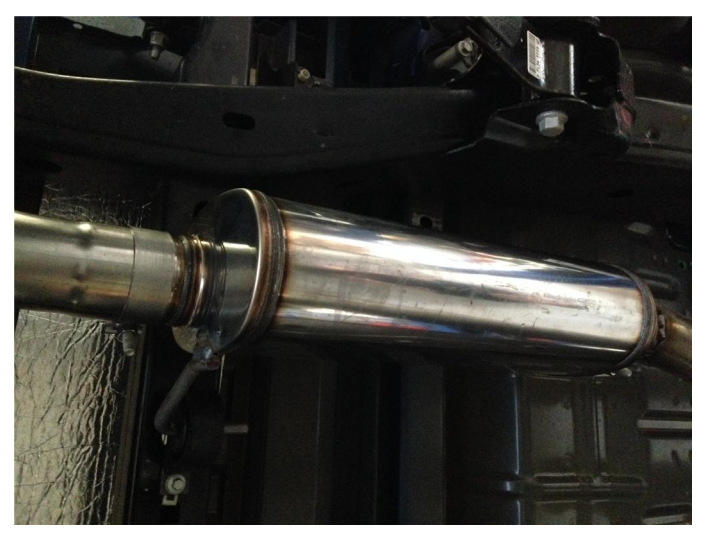
Step 3. Install the Muffler Assembly to the Inlet Pipe Assembly using the supplied 3.00" clamp.

Step 2. Install the new system by attaching the Inlet Pipe Assembly to the OEM catalytic converter outlet pipes using the existing clamp and hardware. Locate the welded hanger to the rubber insulator. Leave all clamps and fasteners loose for final adjustment of the complete system once installed.