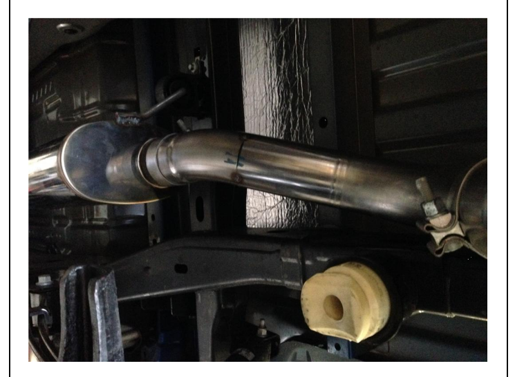
Step 4. Install the Over Axle Pipe using the supplied 3.00" clamps. Locate the welded hanger to the OEM rubber insulator.