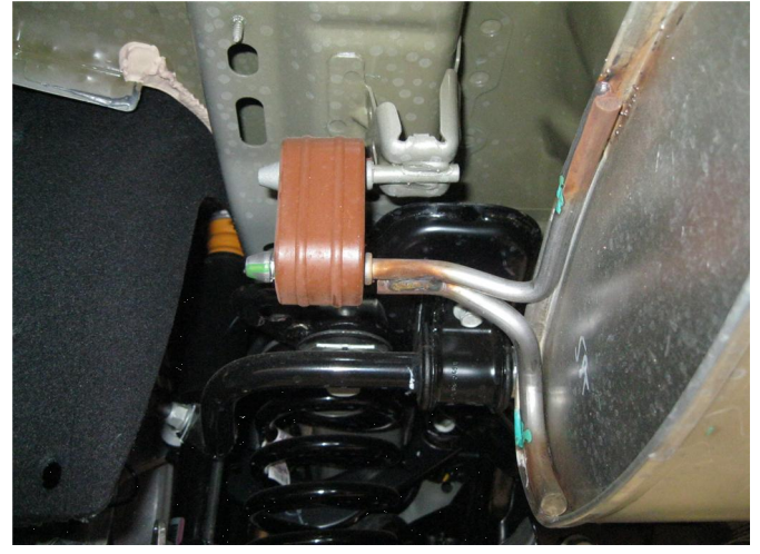
Step 2. Next, remove the welded hangers from the rubber insulators located on the OEM muffler and tail pipe assembly. The exhaust may now be removed in one piece.

Step 1. To remove the OEM exhaust system you will first need to unbolt the OEM system inlet flange from the catalytic converter outlet pipe. Be sure to retain all mounting hardware as it will be needed to mount your new MAGNAFLOW system.