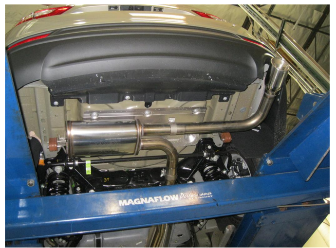
Step 5. Install the Mid Pipe, Muffler Assembly and Tail Pipe Assembly using a similar method. Locate the welded hangers to the OEM rubber insulators.

MAGNAFLOW: 22961 Arroyo Vista - Rancho Santa Margarita, CA 92688 | 1(800) 990-0905 Technical Support: 1(800) 959-9226 | Email: moreinfo@magnaflow.com