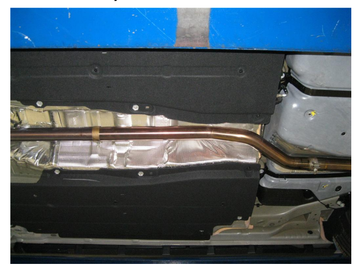
Step 4. Next slip the inlet of the Front Mid Pipe into the Inlet Pipe Assembly and loosely secure using the supplied 2.50" clamp.

Step 3. Begin installing the new system by loosely bolting the flange of the Inlet Pipe Assembly for the outlet flange of the OEM catalytic converter using the supplied bolts and OEM hardware. Keep all fasteners and clamps loose until final adjustment.