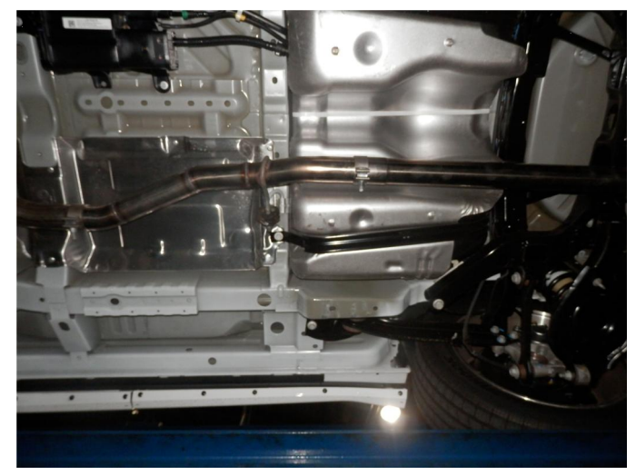
Step 2. Install your new system by first loosely attaching the Inlet Pipe Assembly to the catalytic converter outlet using the OEM clamp. Engage the welded hanger to the rubber insulator.

Step 1. Begin removing your OEM exhaust system by first loosening the clamp attaching the resonator at the outlet of the catalytic converter. This front clamp with be re-used. Working front to rear disengage all welded hangers from the rubber insulators. Be sure to retain all mounting hardware as it will be needed to install your new MAGNAFLOW system.