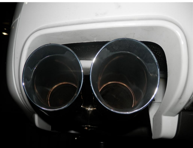
Step 4. Loosely install both Tail Pipe Assemblies using the supplied clamps.