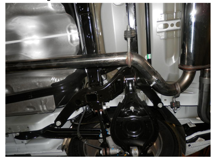
Step 3. Next loosely install the Extension Pipe Assembly and the Muffler Assembly using the supplied clamps. Engage all welded hangers to the rubber insulators.