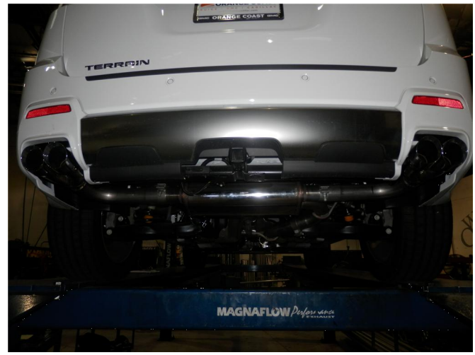
Step 5. Once a final position has been chosen for the new exhaust system, evenly tighten all clamps from front to rear using the torque specifications on page one of the instructions. Inspect all fasteners after 25-50 miles of operation and re-tighten if necessary.