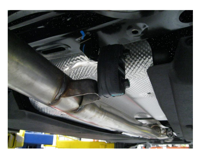
Step 1. To extract the OEM exhaust system begin by un-fastening the flange located behind the catalytic converter and the second flange located in front of the Driver side muffler assembly. Next, working rearward, disengage all welded hangers from the rubber insulators. Do not damage or discard the rubber insulators or fasteners as they will be re-used to mount the new system. You can now remove the exhaust from the vehicle.