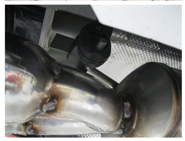
Step 3. Next Install the Muffler Assemblies to the outlets of the Resonator Assembly using the supplied 2.50" clamps. Insert hangers into rubber insulators.