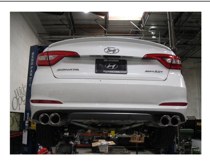
Step 4. Once a final position has been chosen for the new exhaust system, evenly tighten all clamps from front to rear using the torque specifications on page one of the instructions. Inspect all fasteners after 25-50 miles of operation and re-tighten if necessary.