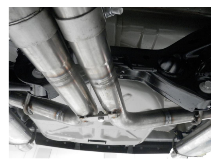
Step 4. Attach the Rear Pipe Assemblies to the Mid Pipes with the supplied 2.25" Clamps. Align the brackets and attach with the supplied fasteners and fit the hangers into rubber insulators.