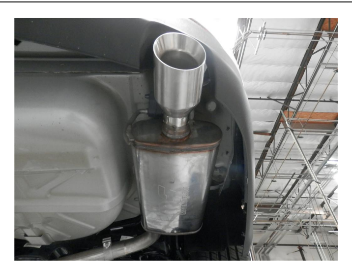
Step 5. Attach the Muffler Assemblies to the Rear Pipes with the supplied 2.25" clamps. Center the tips into the openings in the rear valance and fit the hangers into rubber insulators.