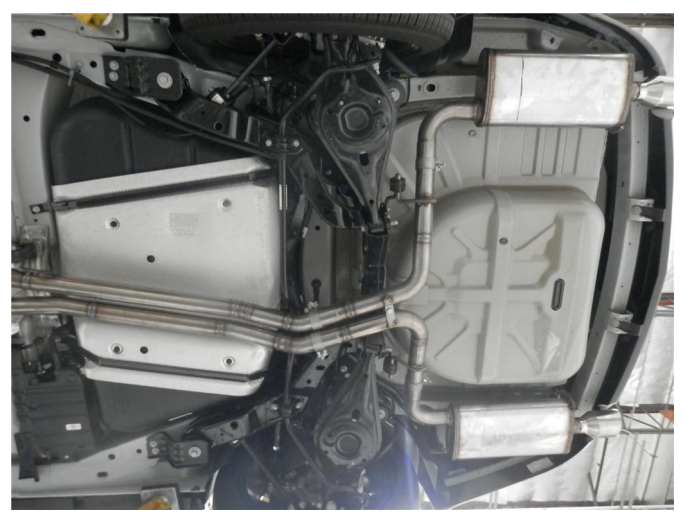
Step 3. Loosely attach the Mid-Pipe Assemblies to the Resonator Assembly with supplied 2.25" Clamps and fit the hanger into the rubber insulator.