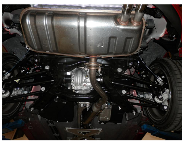
Step 2. Next, unbolt the flange at the muffler assemblly inlet, disengage the hangers from the rubber insulators (save the rubber insulators as they will be used to install the new system) and remove the OEM system.