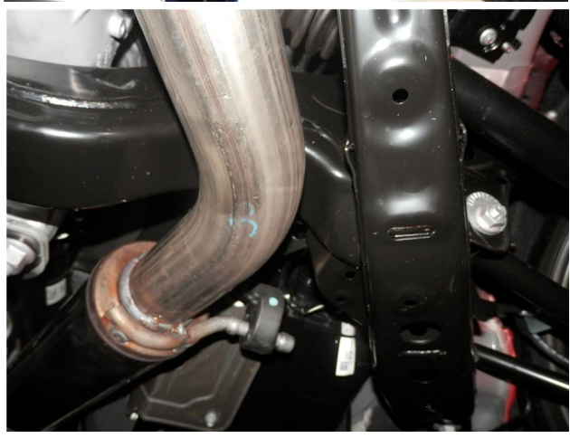
Step 3. Begin installation by attaching the Resonator Assembly to the outlet of the cut pipe using the supplied 2.18" Clamp and fitting the hanger into the rubber insulator. Leave all clamps loose until final adjustment