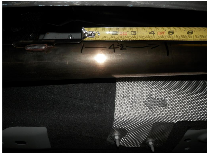
Step 1. Removal of the exhaust system requires cutting and de-burring the pipe 4.50" behind the welded on rear heat shield. To accomplish this you must remove the cross brace..