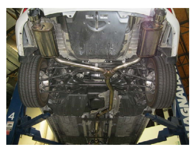
Step 4. Next use the supplied 2.25" clamps to attach the Muffler Assemblies to the Y-Pipe Assembly and insert the hangers into rubber insulators.