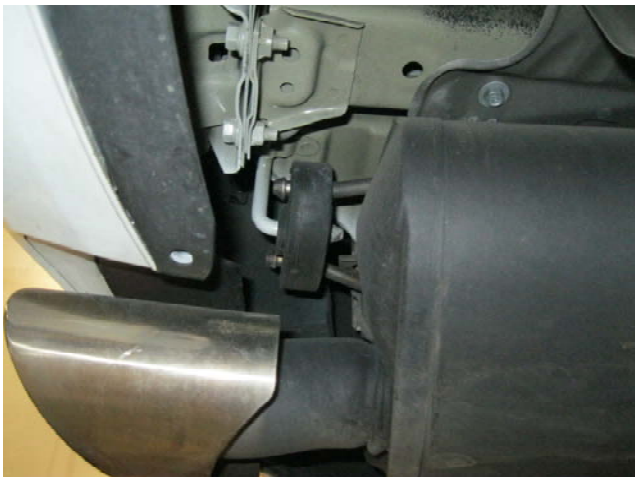
Step 1. To ease removal of the OEM exhaust system unbolt the cross braces located on the underside the vehicle and remove. Begin by unfastening the OEM exhaust system at the flange located at the rear of the vehicle in front of the mufflers, extract the hangers from the rubber insulators and remove the muffler assembly. Do not discard or damage the OEM fasteners or rubber insulators as they will be used to install the new system. Next unfasten the front flange located behind the catalytic converter and remove the resonator asembly.