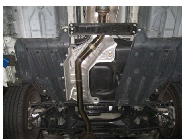
Step 3. Next use the supplied 2.25" clamp to attach the Y-Pipe Assembly to the Resonator Assembly and insert the hanger to rubber insulator.