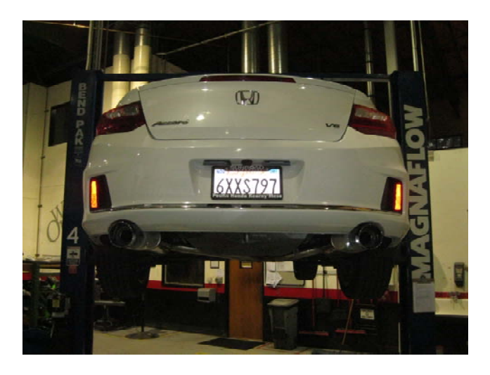
Step 5. Once a final position has been chosen for the new exhaust system, evenly tighten all clamps from front to rear using the torque specifications on page one of the instructions. Inspect all fasteners after 25-50 miles of operation and re-tighten if necessary.