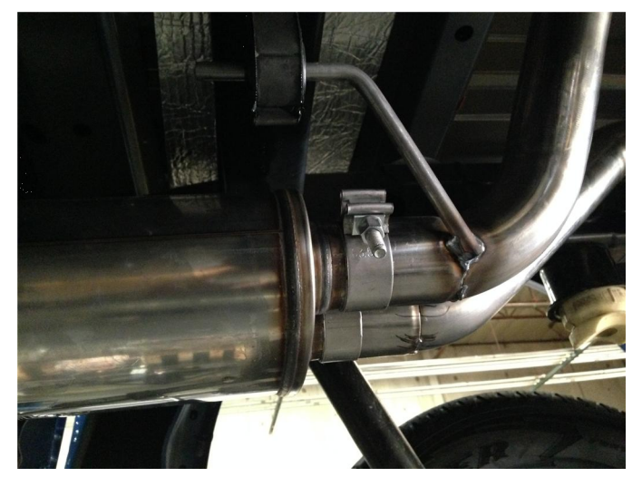
Step 4. Install both the Over Axle Pipes using the supplied 2.50" clamps. Locate the welded hanger to the OEM rubber insulator.

MAGNAFLOW: 22961 Arroyo Vista - Rancho Santa Margarita, CA 92688 | 1(800) 990-0905 Technical Support: 1(800) 959-9226 | Email: moreinfo@magnaflow.com