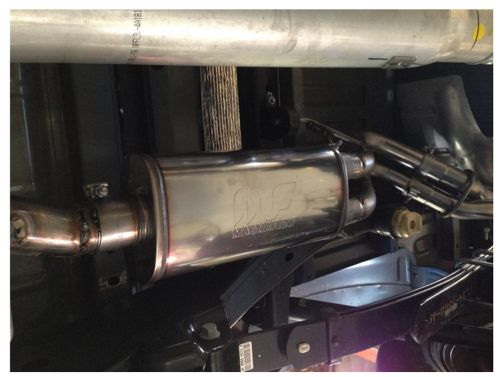
Step 3. Install the Muffler Assembly to the Inlet Pipe Assembly using the supplied 3.00" clamp.

Step 2. Install the new system by attaching the Inlet Pipe Assembly to the resonator outlet pipe using the existing clamp. Locate the welded hanger to the rubber insulator. Leave all clamps and fasteners loose for final adjustment of the complete system once installed.