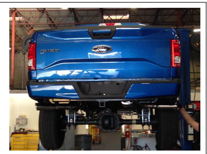
Step 6. Once a final position has been chosen for the new exhaust system, evenly tighten all clamps from front to rear using the torque specifications on page one of the instructions. Inspect all fasteners after 25-50 miles of operation and re-tighten if necessary.

Step 5. To allow for the installation of a dual outlet system on a single outlet vehicle you will have to mount the supplied Hanger Brackets to existing holes in the factory frame rails using the supplied fasteners (8mm bolt and panel nut) as shown in the photos. Once completed you can now slide the Tailpipe assemblies onto the Over Axle pipes and fasten with the supplied 2.50" clamps and mount the hangers to the installed hanger brackets using the supplied rubbber insulators.