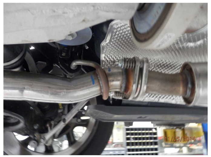
Step 1. Begin removal of the OEM system by cutting both side of the systems exhaust pipes. For the drivers side cut 11" rearward of the welded hanger behind the flange junction as shown in the attached picture.