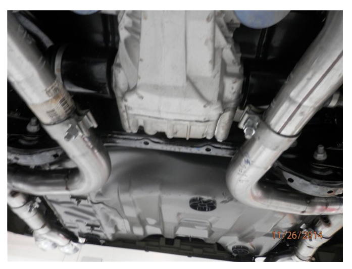
Step 3. Begin installation of your new system by slipping each Inlet Pipe Assembly over the cut OEM outlet pipes. Loosely secure using the supplied 2.25" clamps. Locate the welded hangers to the rubber insulators. Remember to re-attach the ground strap to the hanger. At this point you have two options for tips. Magnaflow supplies a Quad tip setup or an extension pipe assembly to allow the original OEM tips. Select the desired option before continuing the installation.