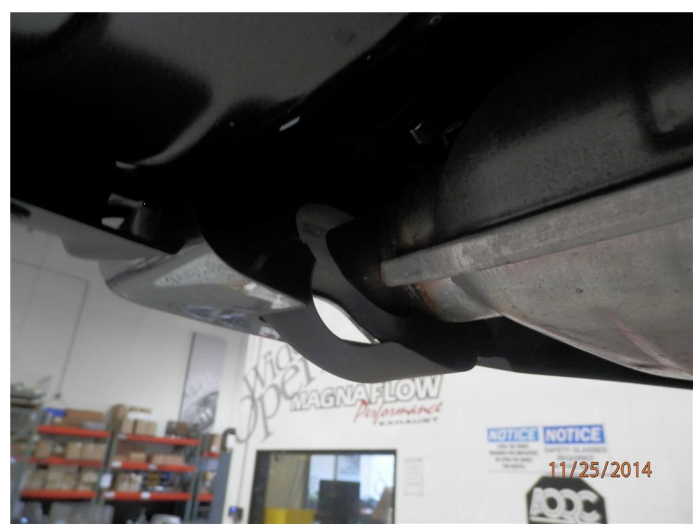
Step 5. To install the Quad Tip option supplied you will first need to remove the OEM tips from the vehicles valence. Remove the four bolts attaching each tip with a 10mm socket.