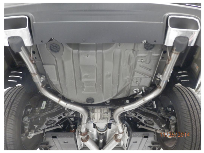
Step 4. To retain the OEM tips on your vehicle select the two OEM Tip Assemblies. Loosely attach each pipe inlet to the Over Axle Pipes outlets using the supplied 2.50" clamps. Engage the welded hangers for each to the rubber insulators.