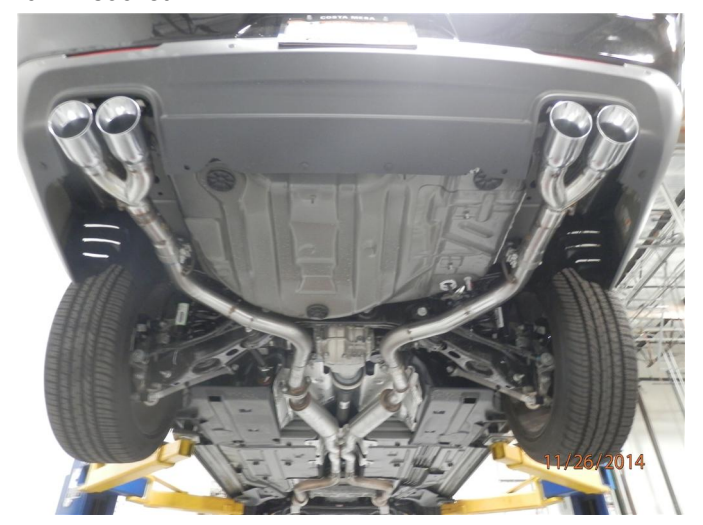
Step 6. Once the tips are removed install the Quad Tip Tailpipe Assemblies using the 2.50" supplied clamps. Locate both welded hangers to the rubber insulators.