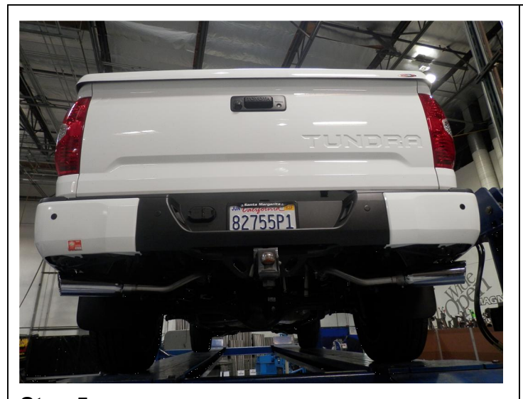
Step 5. Once a final position has been chosen for the new exhaust system, evenly tighten all clamps from front to rear using the torque specifications on page one of the instructions. Inspect all fasteners after 25-50 miles of operation and re-tighten if necessary.