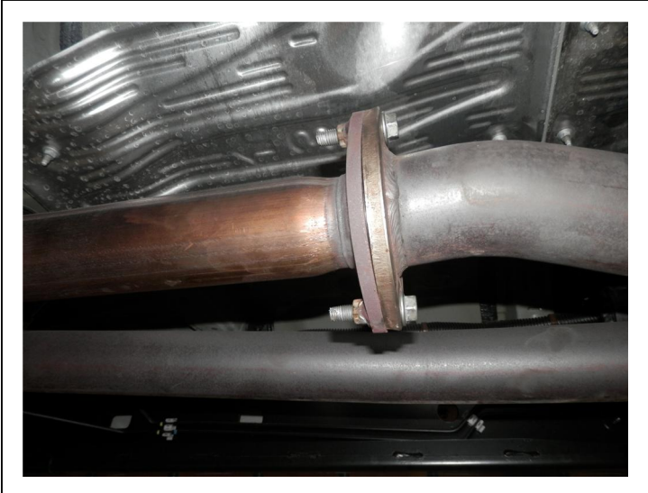
Step 1. To begin the removal of the OEM system you will need to remove the spare wheel. Next unbolt both inlet flanges at the OEM inlet ipie assembly. Working rearward (with the exhaust supported) extract the hangers from the rubber insulators and remove the OEM exhaust. Do not discard or damage the rubber insulators as they will be used to install the new exhaust system.