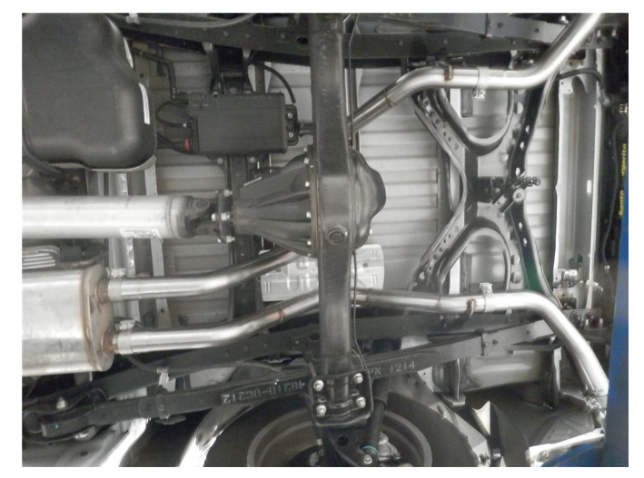
Step 2. Begin installing of the new system by attaching both of the Inlet Pipe Assemblies to the outlets of the OEM system using the OEM hardware. Next attach the Mufler Assembly to the inlet pipes with supplied clamps and insert the hangers into the rubber insulators. Keep all clamps loose for final adustment of the system.