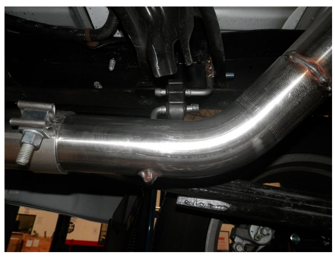
Step 3. Attach the supplied Hanger Bracket Assembly to the vehicles subframe using the Bracket Plate and supplied hardware. There is an existing hole in the subframe located on the drivers side. Loosely install both Inlet Pipes to the muffler Assembly using the supplied 2.50" clamps and engaging the welded hangers to the rubber insulators. Install the Mid Pipe Assembly in a similar fashion locating the welded hanger to the Hanger Bracket Assembly you previouisly installed using the supplied Rubber Insulator.