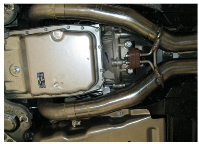
Step 4. On vehicles with automatic transmission you will need to disconnect the shift linkage located on the drivers side of the transmission.

Step 3. Next, remove the six 10mm bolts from the valence top. Carefully release the tabs on the top of the valence. The valence may now be removed.