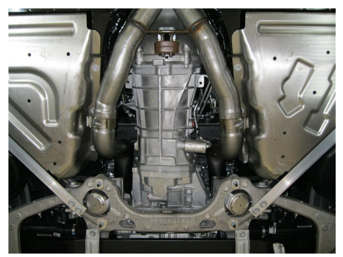
Step 7. Begin installation of you new MAGNAFLOW exhaust system by attaching each valve motor to the new system using the OEM fasteners. Install both drivers side and passengers side Inlet Pipe Assemblies to the OEM X-Pipe. Loosely secure using the OEM clamps.

Step 6. Loosen both OEM clamps just rearward of the stock X-Pipe assembly. The OEM exhaust system may now be removed.