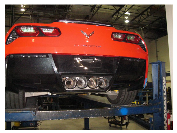
Step 9. Once a final position has been chosen for the new exhaust system, evenly tighten all clamps from front to rear using the torque specifications on page one of the instructions. Inspect all fasteners after 25-50 miles of operation and re-tighten if necessary.

Step 8. Locate both OEM hanger brackets to each Tail Pipe Assembly. Next, loosely attach both assemblies to the Inlet Pipe Assembly outlets using the supplied 3.00" clamps. Using the supplied nuts, bolts and washers connect the two hanger brackets that will link both sides together. Reconnect each wiring harness connector the the valve motors. Reinstall the rear valence in the reverse order of the removal process.