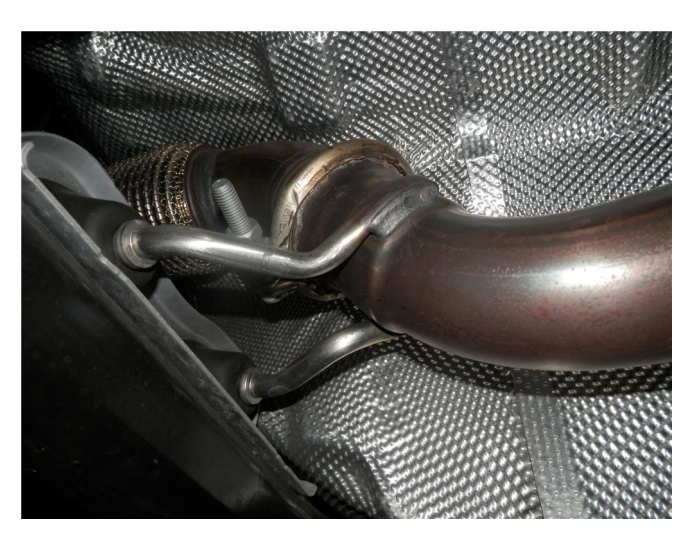
Step 2. Begin removing the OEM exhaust by unfastening the clamp located behind the flex pipe.