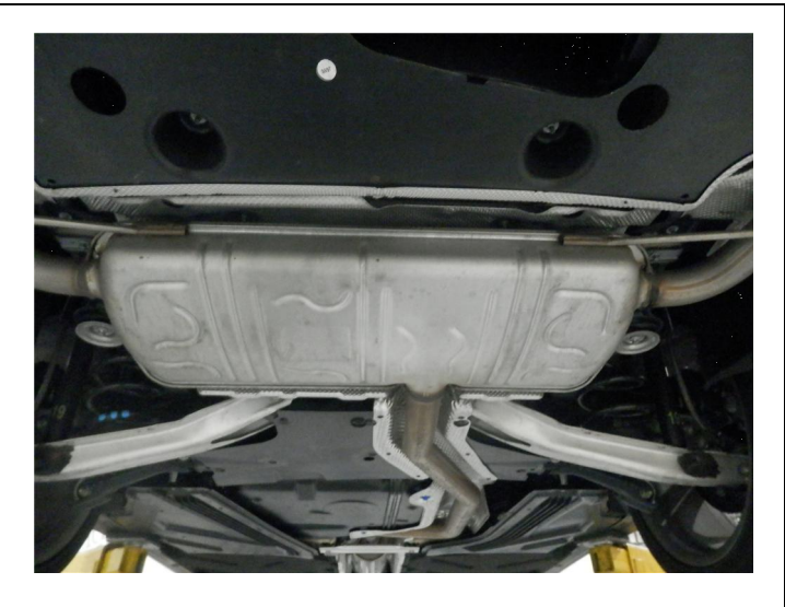
Step 3. With the exhaust supported, work front to rear and extract the welded hangers from the rubber insulators. Do not dicard or damage the clamp or insualtors as they will be re-used to install the new MagnaFlow exhaust.