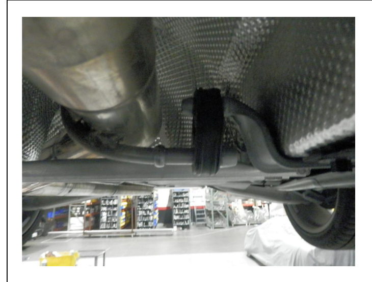
Step 5. Next, attach the Mid-Pipe Assembly to the Inlet pipe using the supplied 2.50" clamp and fitting the hanger to the rubber insulator.