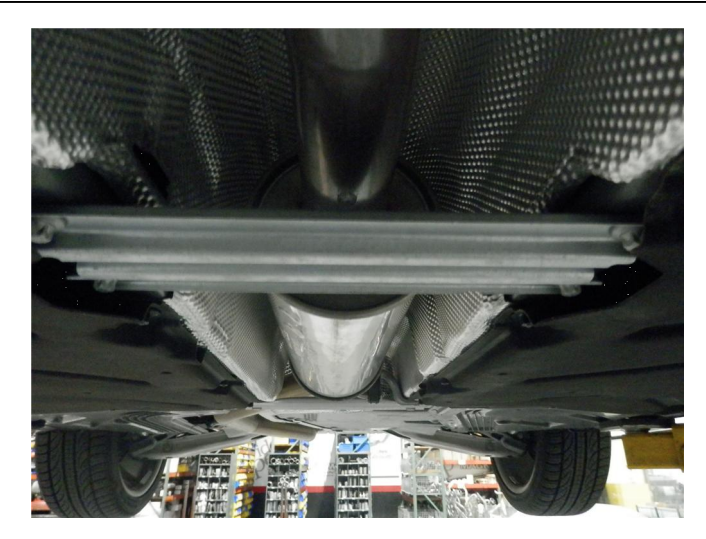
Step 1. To extract the OEM exhaust you will need to remove both cross braces located on the underside of the vehicle.