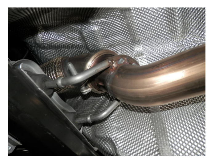
Step 4. Begin installation of the MagnaFlow exhaust by attaching the Inlet Pipe Assembly to the flex outlet using the factory clamp and fitting the hangers into the rubber insulators.