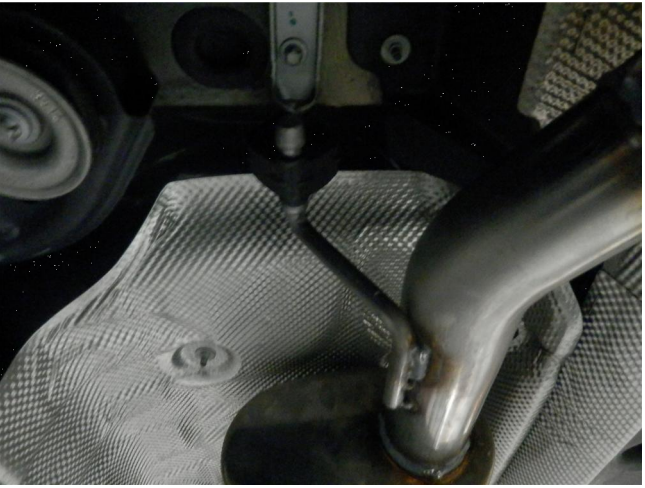
Step 6. Complete installation by attaching the Muffler Assembly to the Mid-Pipe using a supplied 2.50" clamp and fitting the hangers into the rubber insulators. Re-attach cross braces.