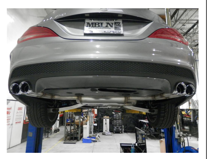
Step 7. Once a final position has been chosen for the new exhaust system, evenly tighten all clamps from front to rear using the torque specifications on page one of the instructions. Inspect all fasteners after 25-50 miles of operation and re-tighten if necessary.