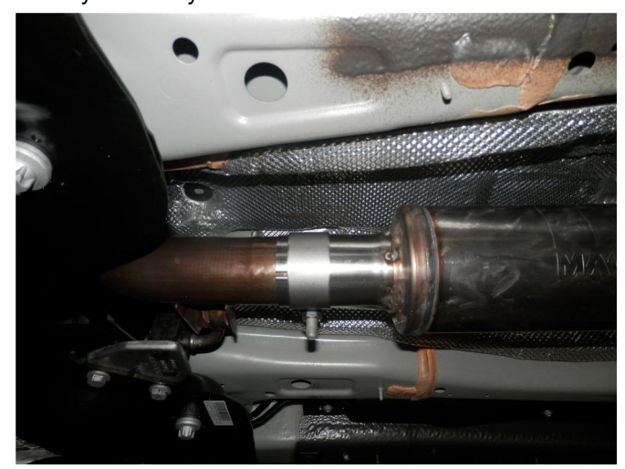
Step 2. Install the Resonator Assembly by slipping the inlet end over the outlet of the catalytic converter. Loosely secure using the supplied 2.18" clamp.