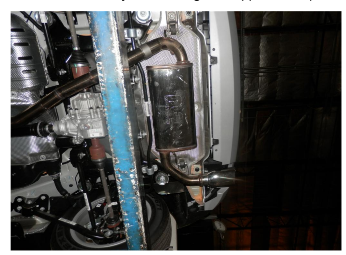
Step 4. Loosely install the Muffler Assembly to the Mid Pipe with the supplied clamp. Locate both welded hangers to the OEM rubber insulators.