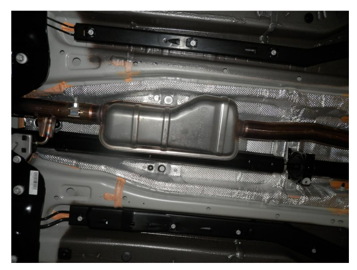
Step 1. To remove the OEM exhaust loosen the factory clamps in front of the resonator assembly and the one attaching the resonator assembly to the mid pipe. Disengage all welded hangers fron the rubber insulators. Be sure to retain all mounting hardware as it will be needed to install your new MAGNAFLOW system. The OEM system may now be removed.