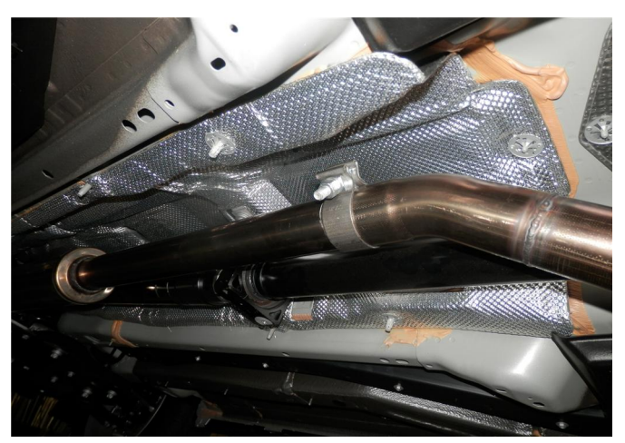
Step 3. Next loosely attach the Mid Pipe to the Resonator Assembly outlet using the supplied clamp.