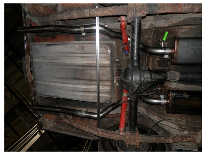
Step 5. Next, loosely attach the desired Tail Pipe Options using the suppled clamps.

MAGNAFLOW: 22961 Arroyo Vista - Rancho Santa Margarita, CA 92688 | 1(800) 990-0905 Technical Support: 1(800) 959-9226 | Email: moreinfo@magnaflow.com