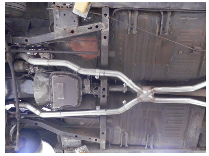
Step 1. Begin installation of you new exhaust system by loosely installing the two Inlet Pipes to the installed Magnaflow Manifold Front Pipes (sold separately) using the supplied clamps. These pipes may need to be trimmed to assure correct fitment.

NOTE: This kit is designed to be used with Magnaflow Manifold Front Pipes 19303/19343. Please check for your vehicles correct application at www.magnaflow.com