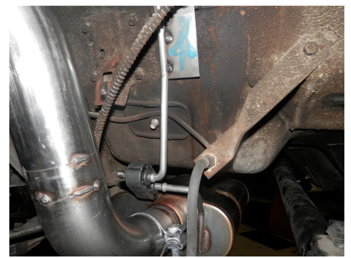
Step 4. The extra Hanger Bracket supplied is for vehicles that came stock with one tail pipe. This bracket is to be located to the E-Brake cable bracket. Loosely secure with the supplied hardware.