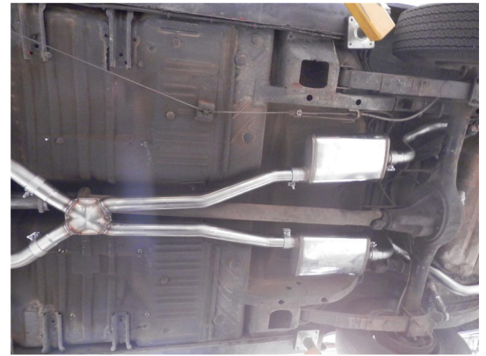
Step 2. Loosely attach the X-Pipe Assembly to the Inlet Pipes and then the Muffler Assembles to the X-Pipe Assembly using the suppled clamps.