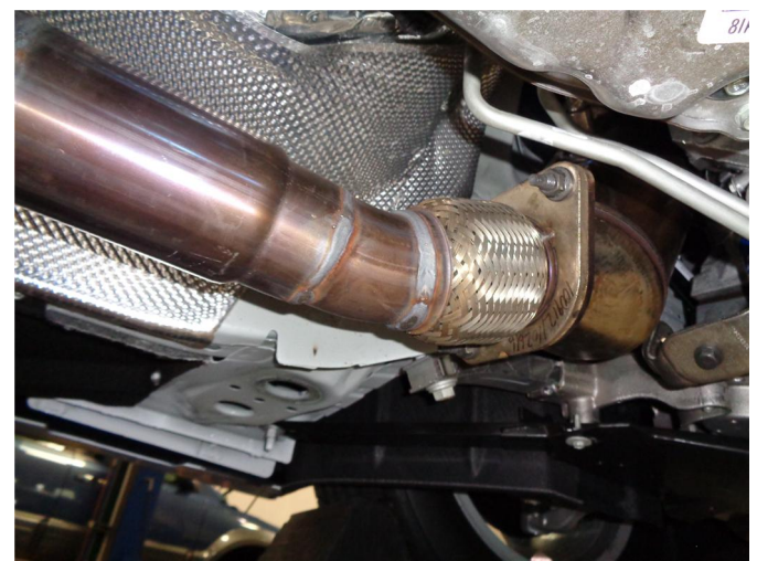
Step 2. Begin installation of your new MAGNAFLOW system by loosely bolting the Inlet Pipe Assembly to the catalytic converter outlet flange using the OE fasteners.

Step 1. To remove the OEM exhaust you will need to unbolt and remove the cross brace shown. Now you can unbolt the OEM exhaust from the catalytic converter flange junction. Disengage all welded hangers from the rubber insulators. Retain rubber insulators as they will be needed to install your new MAGNAFLOW system. The OEM system can now be removed.