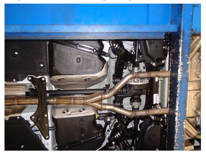
Step 3. Next, loosely install the Y-Pipe Assembly using the supplied 3.00" clamps. Locate the welded hangers to the rubber insulators.