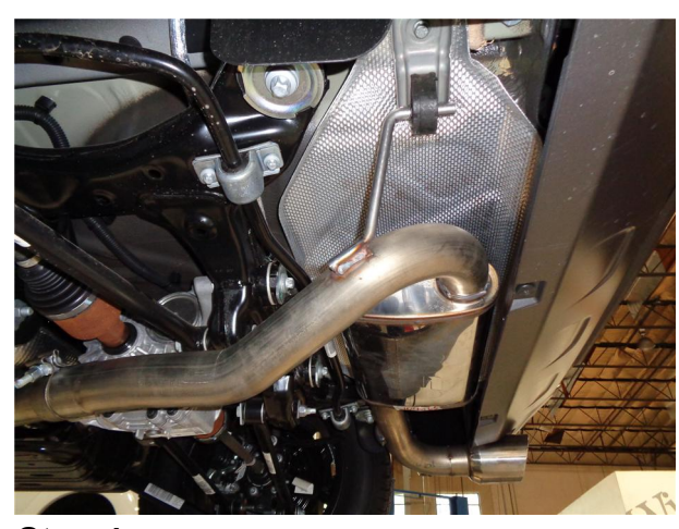
Step 4. Mount the Muffler Assembly to the Mid Pipe with the supplied 2.50" clamp and locate both welded hangers into the OEM rubber insulators.