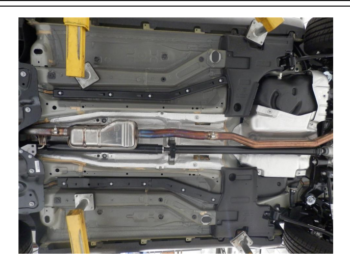
Step 1. To remove the OEM exhaust loosen the factory clamps in front of and behind the factory resonator assembly. Disengage all welded hangers from the rubber insulators. Retain rubber insulators as they will be needed to install your new MAGNAFLOW system. The OEM system can now be removed.