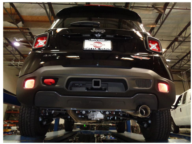
Step 5. Once a final position has been chosen for the new exhaust system, evenly tighten all clamps from front to rear using the torque specifications on page one of the instructions. Inspect all fasteners after 25-50 miles of operation and re-tighten if necessary.