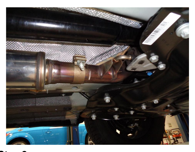
Step 2. Begin installation of your new MAGNAFLOW system by slipping the Resonator Assembly inlet end over the Catalytic Converter outlet locating the alignment pin into the coresponding slot on the Resonator inlet. Loosely secure using the supplied 2.25" clamp. Leave all clamps loose during initial installation.