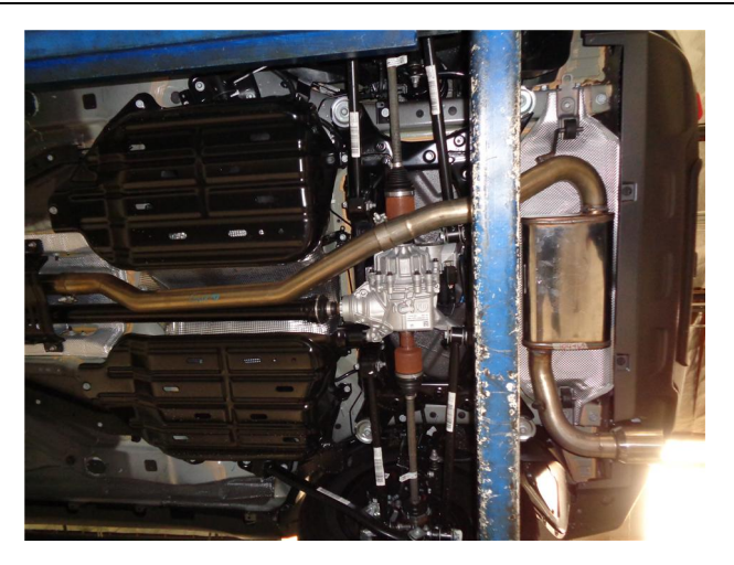
Step 3. Next, attach the Mid Pipe to the Resonator Assembly outlet using the supplied 2.50" clamp.