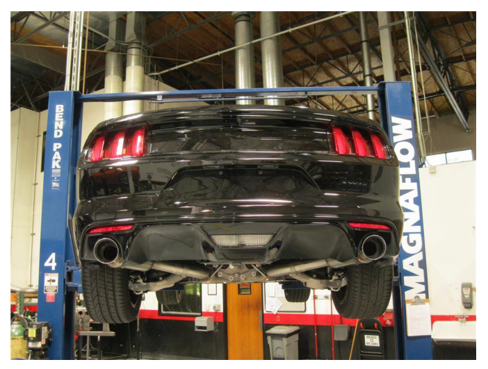
Step 4. Once a final position has been chosen for the new exhaust system, evenly tighten all clamps from front to rear using the torque specifications on page one of the instructions. Inspect all fasteners after 25-50 miles of operation and re-tighten if necessary.