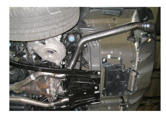
Step 3. Next attach both Tailpipe Assemblies to the Inlet Pipe Assemblies using the supplied 2.50" clamps and fitting the hangers into the rubber insualtors.