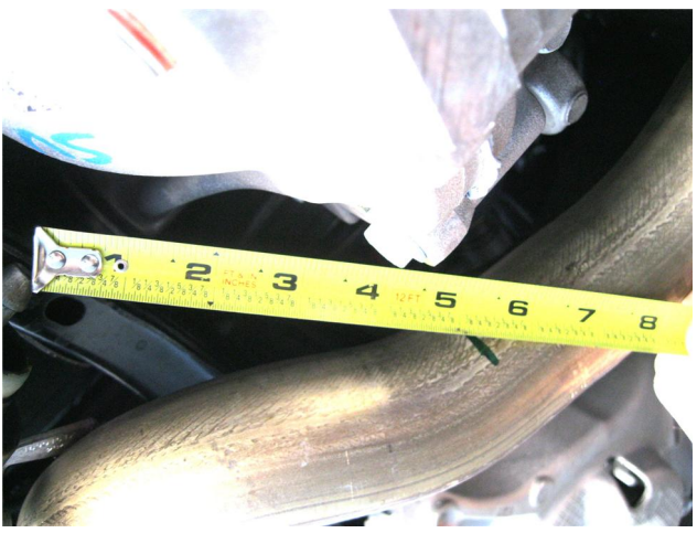
Step 1. (NOTICE: This exhaust system fits on both convertible and coupe Mustangs. To install the system on a convertible you must first remove all underbody bracing.)Begin removing the OEM exhaust system by cutting both pipes going into the muffler assemblies. Cut both sides approx. 5.0" forward of the hanger end as shown in accompanying photos. The cut points line up with the rear of the differential. Next working front to rear extract the hangers from the rubber insulators and remove the OEM system. Retain insulators and clamps as they will be used to install the new system.