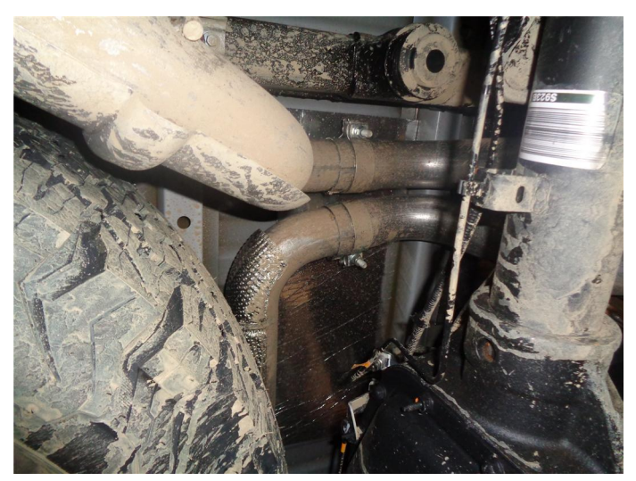
Step 1. Begin removal of the OEM exhaust system by loosening the band clamps attaching the tail pipe assemblies to the over axle pipes. Disengage all welded hangers from the rubber insulators and remove both tail pipes. Retain all mounting hardware as it will be used to install your new system.