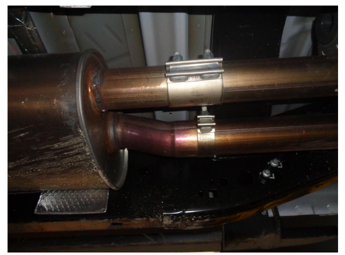
Step 2. Next loosen both band clamps attaching the rear muffler subassembly to the inlet muffler assembly. Disengage all welded hangers from the rubber insulators. The muffler subassembly may now be removed.