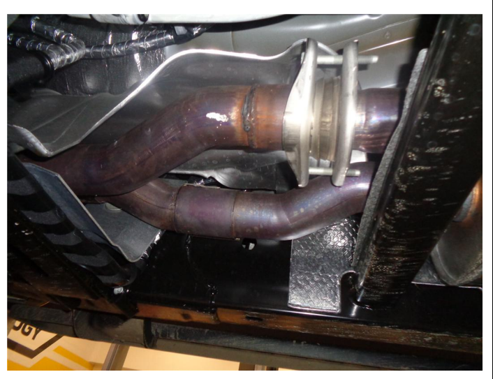
Step 3. Finally remove of the OEM inlet muffler assembly by unbolting the inlet at the driver side flange junction and loosening the band clamp on the passenger side inlet pipe. Remove the inlet muffler asembly. You are now ready to install your new MAGNAFLOW exhaust system.