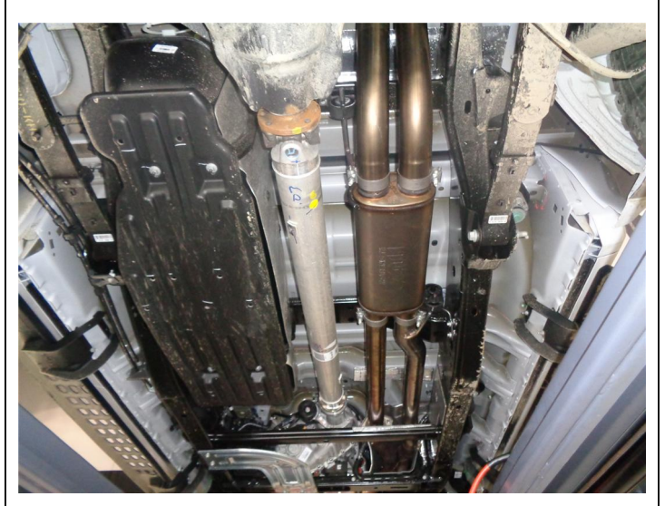
Step 6. Install the Muffler Assembly by attaching the the inlet nipples to the outlets of both Inlet Pipe Assemblies. Loosely secure using the supplied clamps. Engage the welded hanger to the rubber insulator.