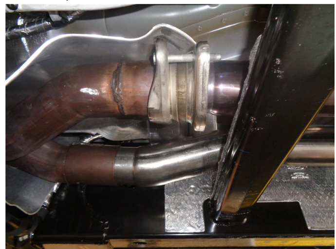
Step 4. - NOTICE - this exhaust kit works with both the SuperCrew and SuperCab models. The SuperCrew has adittional parts. Begin the installation by slipping the inlet of the P/S Inlet Pipe Assembly into the OEM band clamp. On the SuperCab model engage the welded hanger into the rubber insulator. Next bolt the D/S Inlet Pipe assembly to the OEM flange junction using the supplied nuts. All clamps and fasteners are to remain loose until final installation.