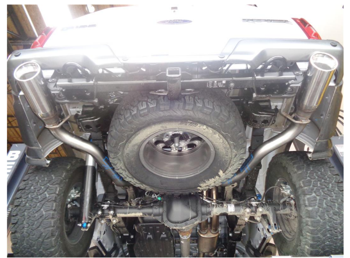
Step 8. Lastly loosely attach both Tail Pipe Assemblies to the Over Axles Pipes using the supplied clamps. Engage all welded hangers to the rubber insulators.