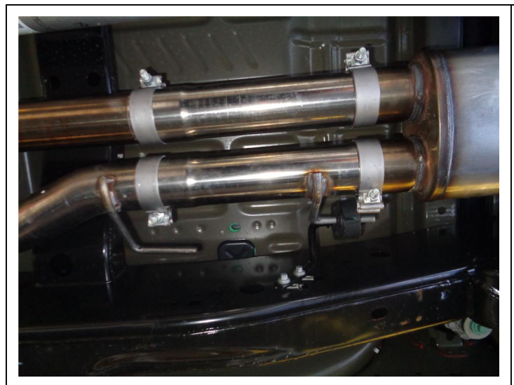
Step 5. FOR THE SUPERCREW ONLY, install both extension pipes into the resonator outlets and engage the hanger into the rubber insulator.