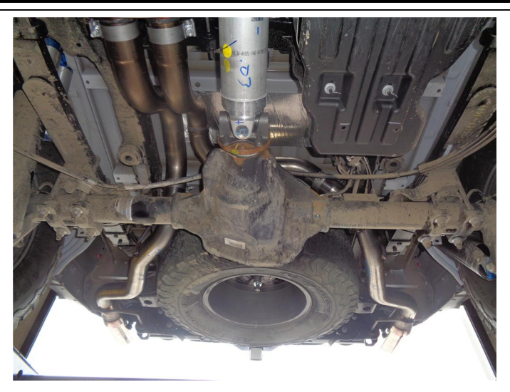
Step 7. Loosely attach both Over Axle Pipes to the Muffler Assembly outlet nipples using the supplied clamps.