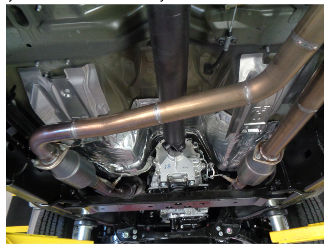
Step 2: Begin installing your new system by loosely bolting both inlet flanges of the D/S and P/S Inlet Pipe Assemblies to the catalytic converter outlets using the OEM hardware. Engage the D/S hanger to the rubber insulator.