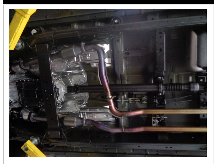
Step 1: To remove the OEM system first unbolt both inlet pipes at the catalytic converter flange junctions. Working front to rear disengage all welded hangers from the rubber insulators. The OEM exhaust system can now be removed in one piece. Be sure to retain all mounting hardware as it will be needed to install your new MAGNAFLOW system