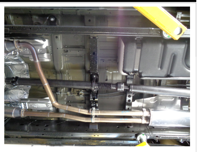
Step 3: Next loosely fasten both Extension Pipes to the Inlet Pipe Assemblies using the supplied clamps.