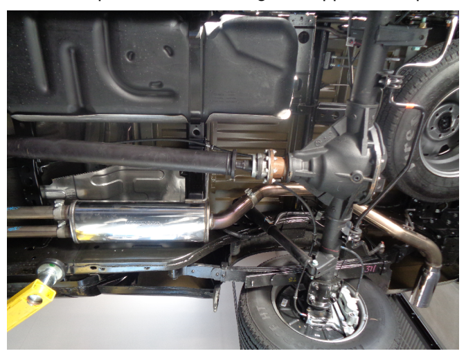
Step 4: Loosely attach the Muffler Assembly to the two Extension Pipes using the supplied clamp and engaging the welded hanger to the rubber insulator. Install the Tail Pipe Assembly the same way.

MAGNAFLOW: 1901 Corporate Centre Dr - Oceanside, CA 92056 | 1(800)990-0905 Technical Support: 1(800) 959-9226 | Email: moreinfo@magnaflow.com