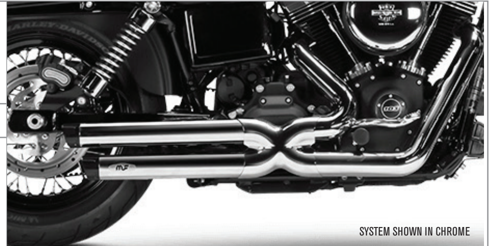
SYSTEM SHOWN IN CHROME